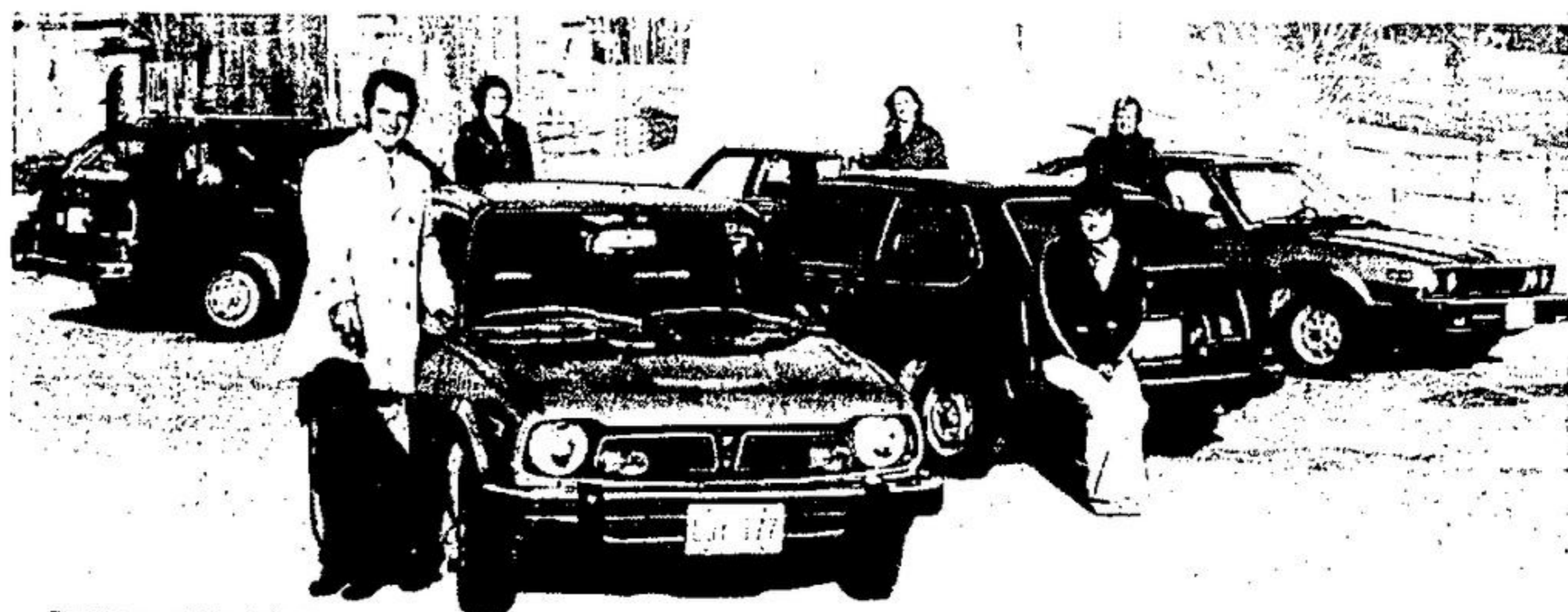
The five car, all Honda family.

"There's 3 Civics, an Accord and a Wagon. And once they drove mine, they were convinced that this is the car they should have. They were entirely free to make up their own minds. I guess Father knows best."