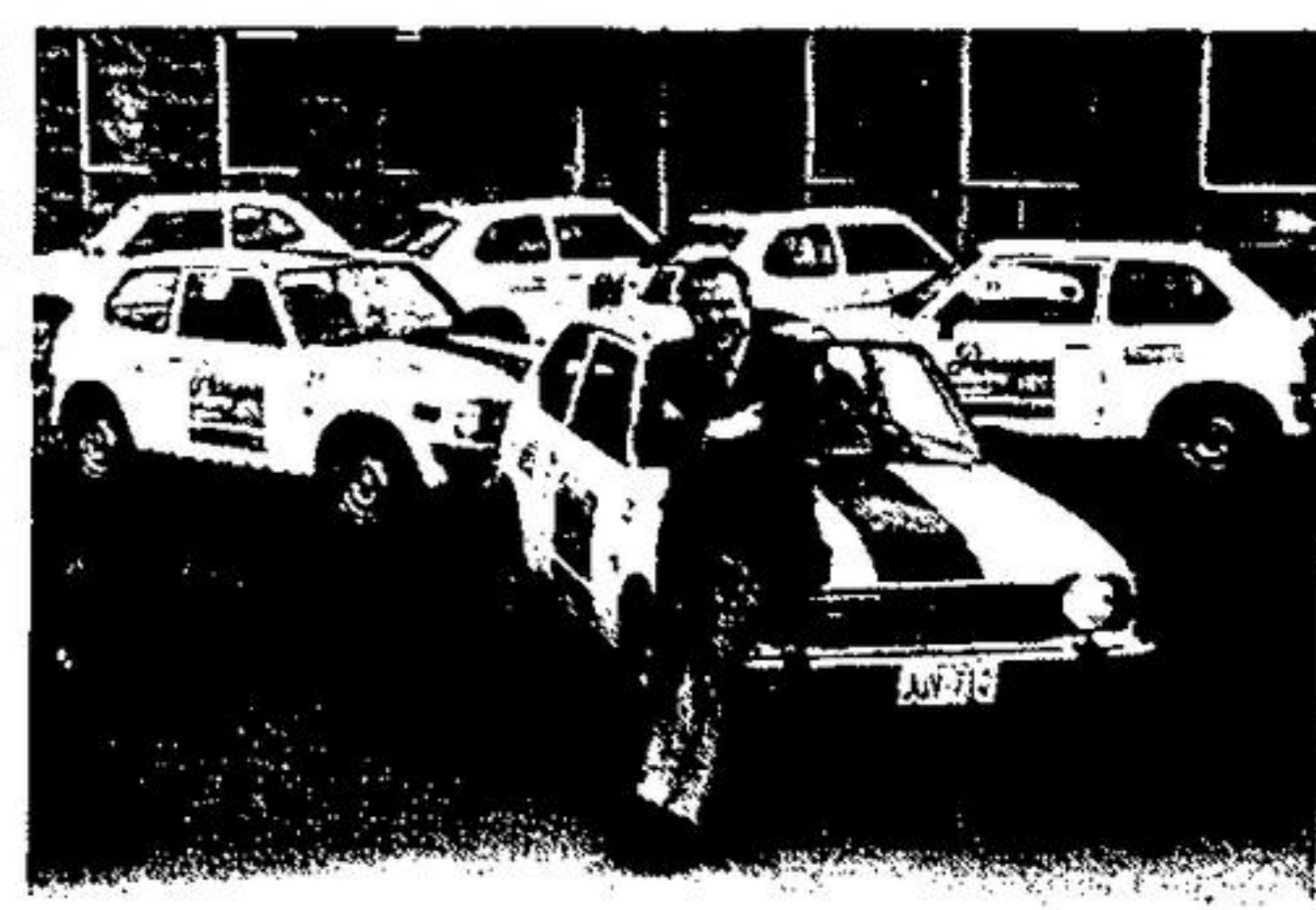
The businessman who owns a fleet of Honda Civics.

"We were looking for an economical car. We've tried several of them. Honda was one we hadn't tried. We wanted to see how it compared with the other ones. I went to the dealer's and tried the car out. I was quite impressed by it. This was when we bought our first one and we subsequently bought the other five about six months later."