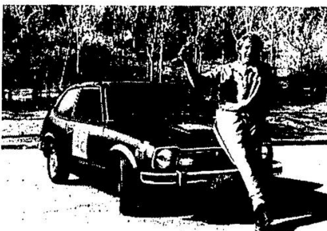
The Civic with racing blood. (Volant Québecois series)

"The races this year were up at Mont Tremblant, we had one at Mosport, St. Ayr and Three Rivers Gran Prix. I came in fifth in my class. That's pretty good, first year of racing. I had never driven a front wheel drive car or a Honda. It's been good on the track. Very peppy, handles beautifully. I've always liked racing, and on a track, you don't get speeding tickets."