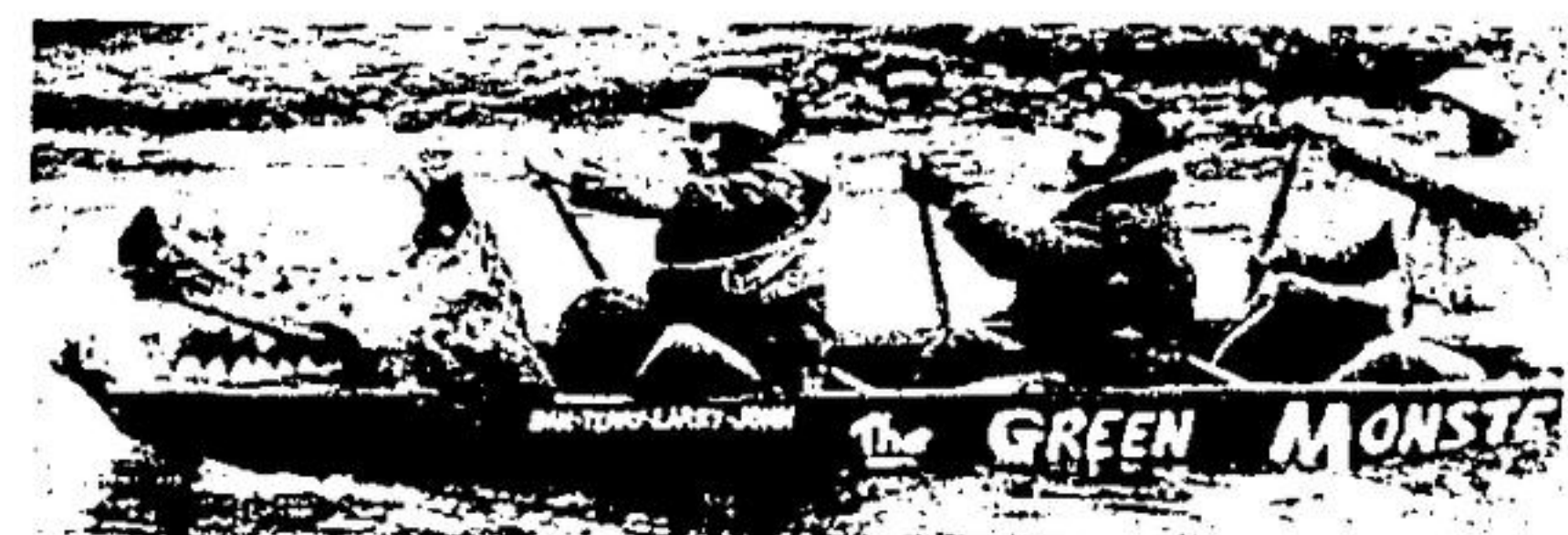
Stroke! Stroke! Stroke!