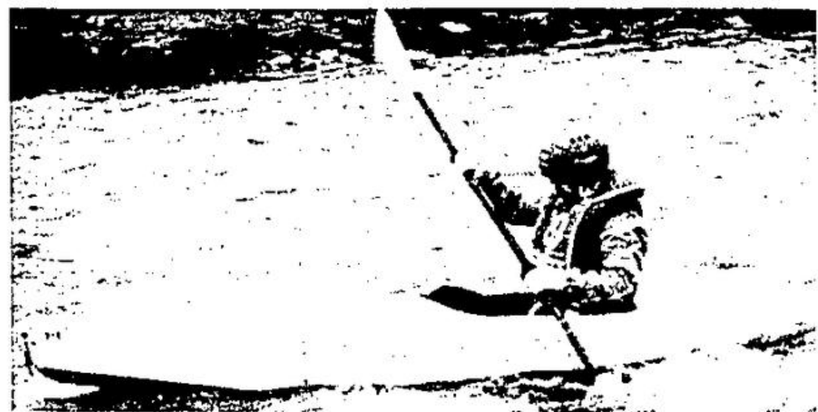
Just taking it in stride