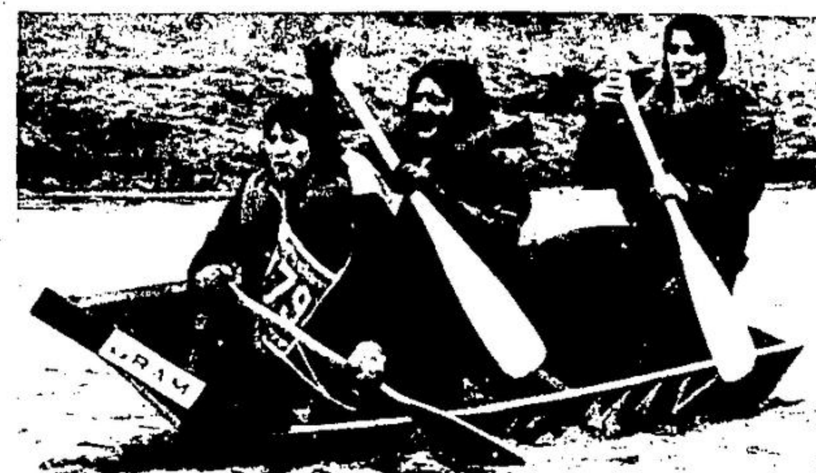
Lean to the starboard!