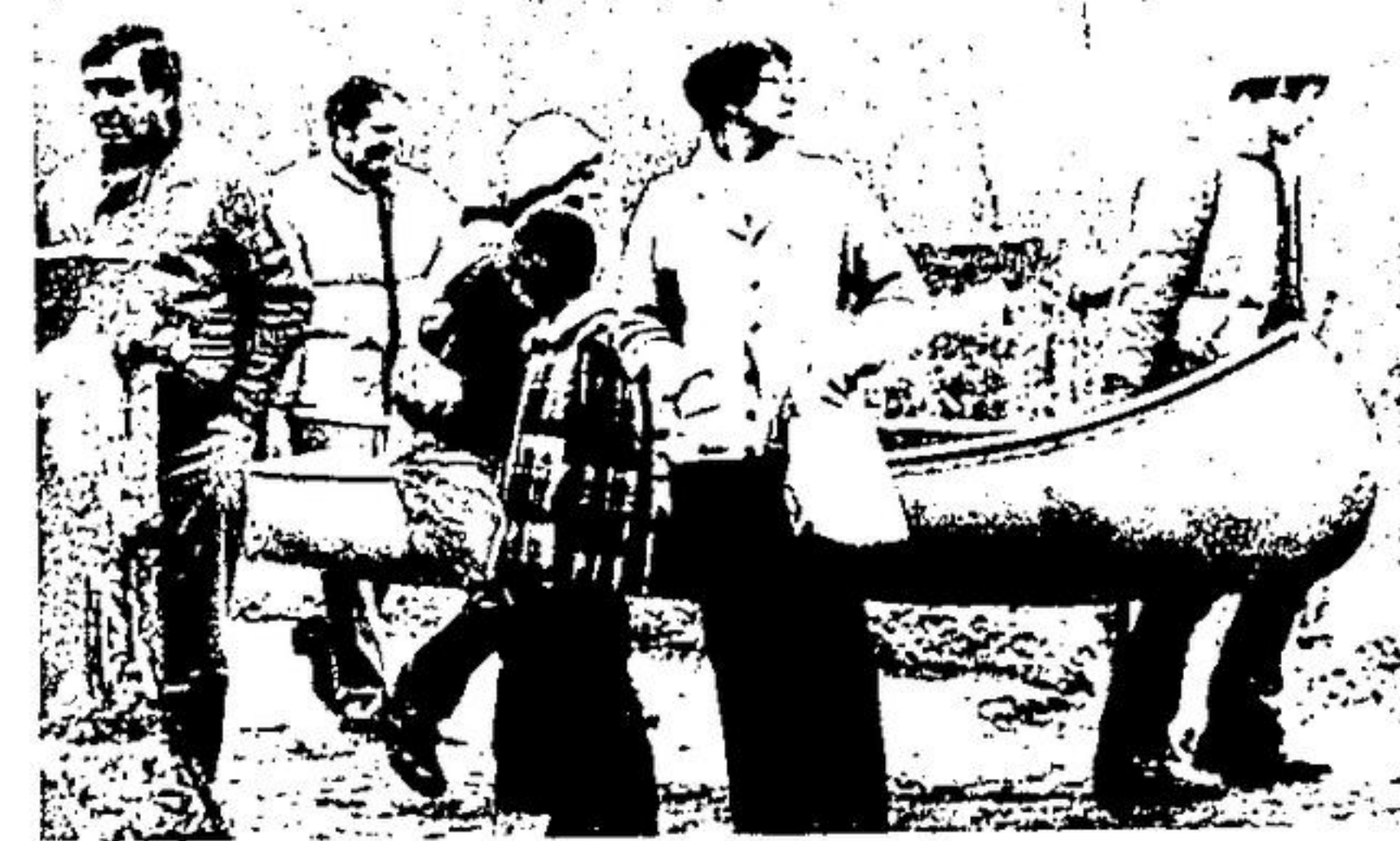
Well, wait until next year