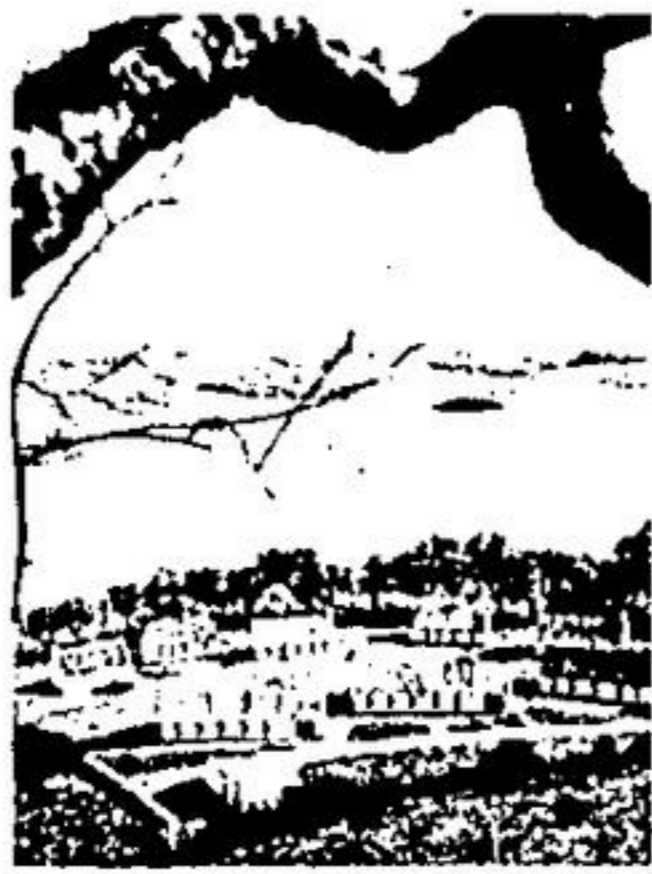
Rest in Irish cottage.

identified by a special sign and listed in our official guide. Traditional thatched cottages. In carefully selected beauty spots in Counties Clare, Galway, Donegal, Tipperary and Mayo there are small groups of thatched cottages built in the traditional style