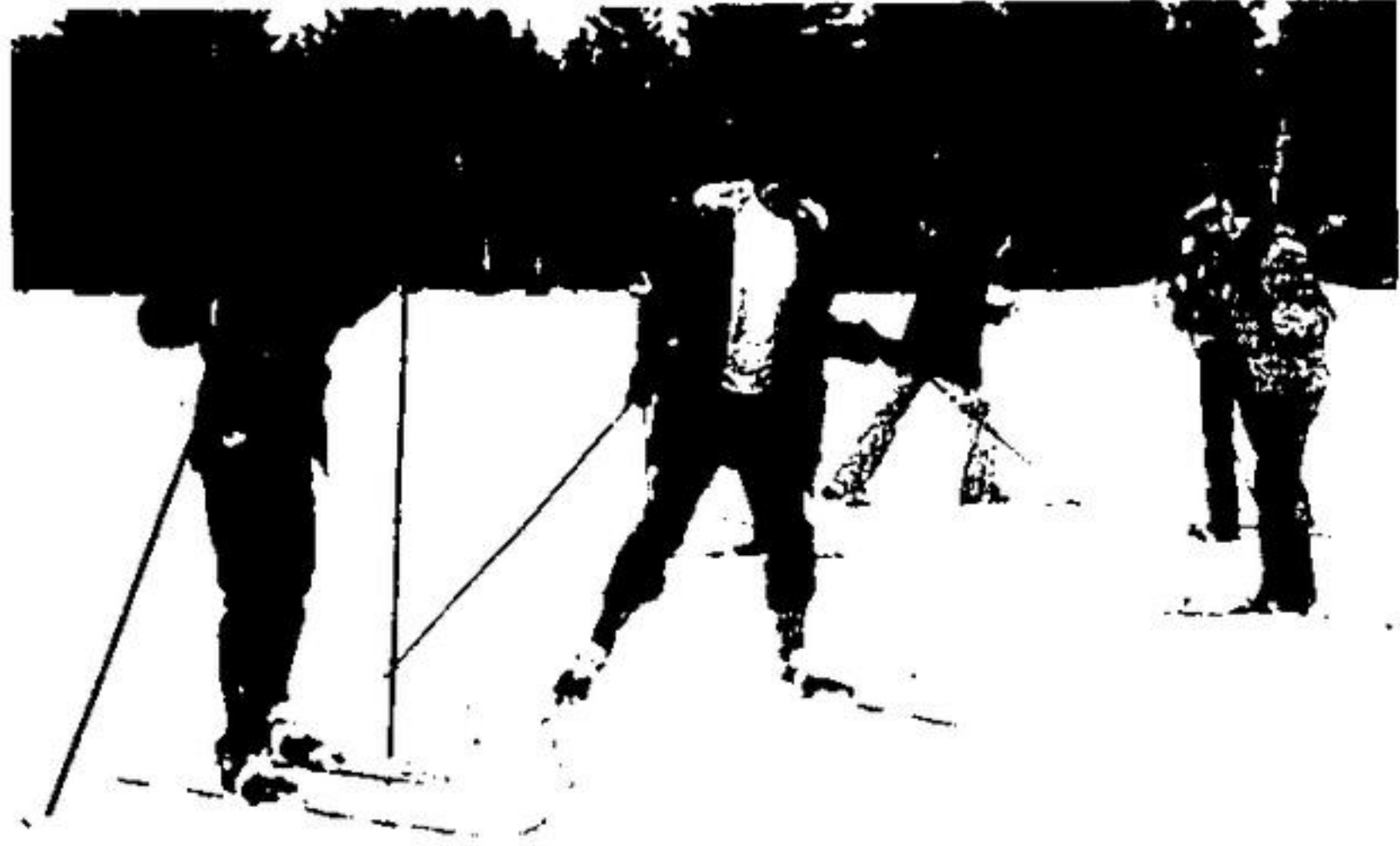
NOW JUST A MINUTE! THIS IS SUPPOSED TO BE EASY!

This program, which is new and only for Army Cadets, will continue and hopefully will be expanded into longer trips.