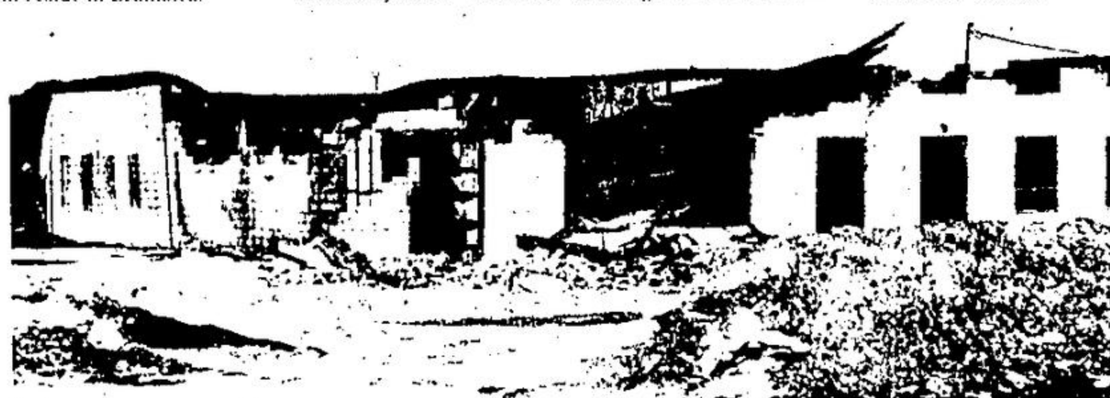
POLICE SEEK ARSONIST IN $3.5 MILLION BLAZE