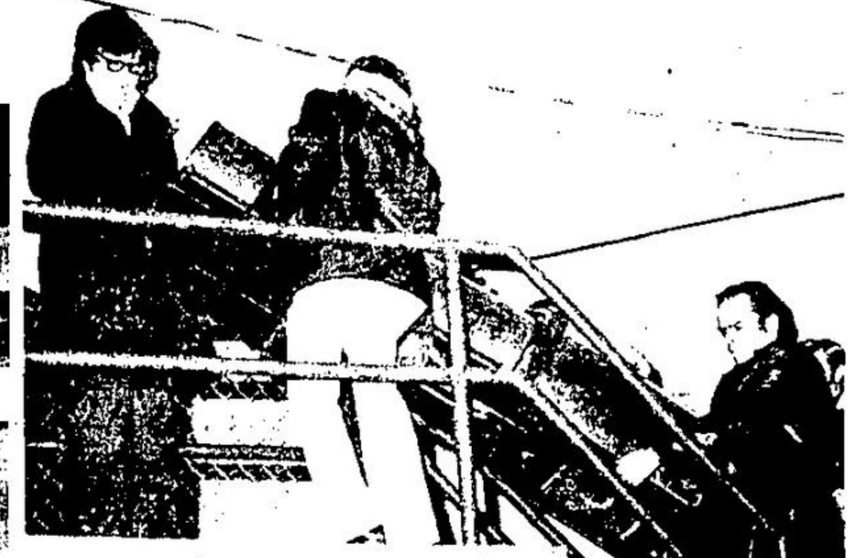
THAT ISN'T A TORPEDO. IT'S A SPOTLIGHT BEING HOISTED INTO POSITION FOR THE FIGURE SKATING LAST WEEKEND.

A dress rehearsal for the ice carnival was held Friday night and final touches to the props could not be added until after 10 p.m. Volunteers painted posters of the title of the acts and attached them to the sides of the boards surrounding the ice rink, decorative swishes of paint brushes were added to a showboat and the front stage prop. Brian Peart, Georgetown Figure Skating Club publicity member felt the carnival ran fairly well. Skaters were accepted for the carnival, on a first-come first-serve basis, no audition was necessary. The carnival cost to each child was $2 for costumes. Mr. Peart feels the carnival is a great boost for a child's moral. "It is their chance to be a star," he said.