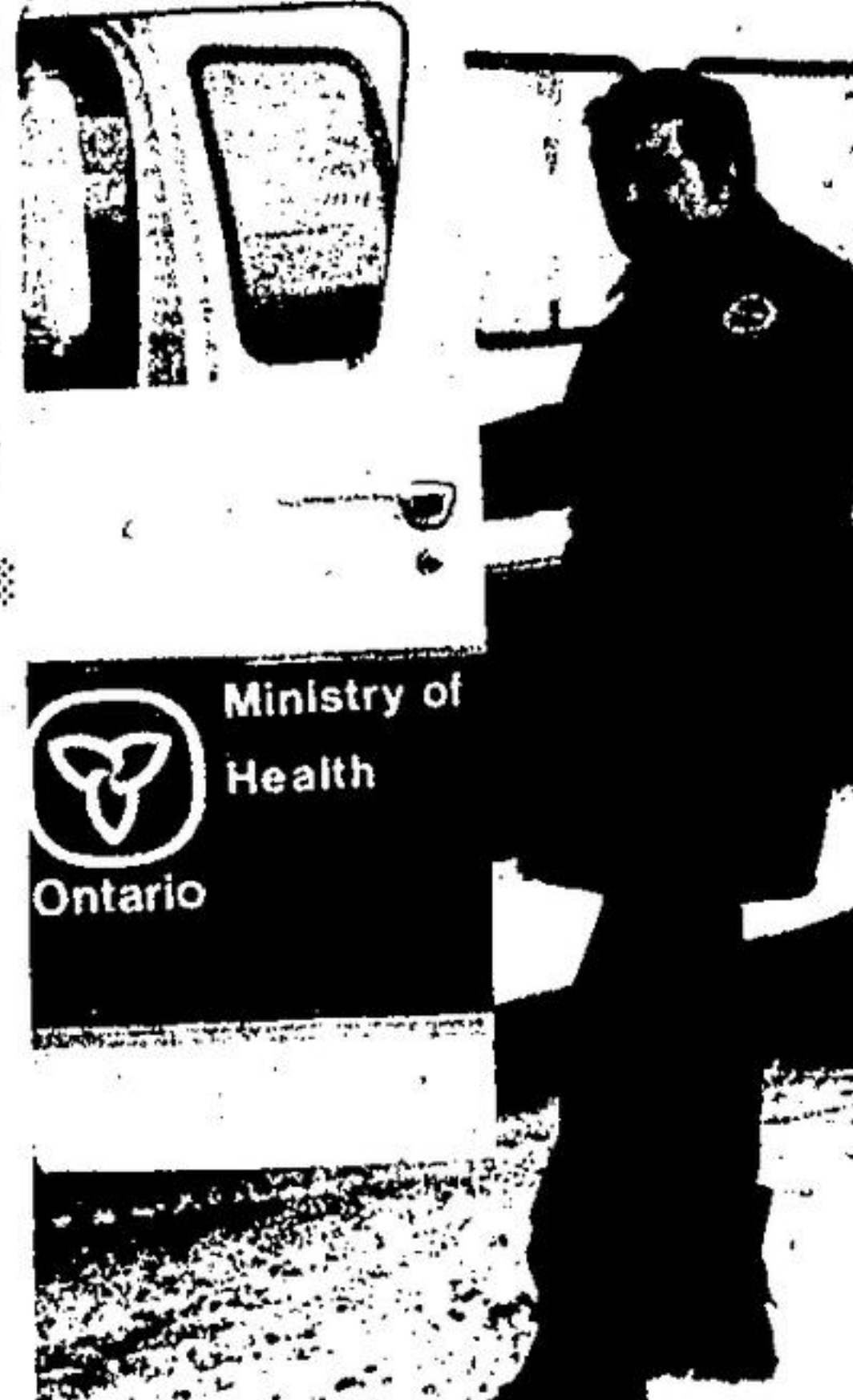
Frank Tyrell, on-call Georgetown volunteer ambulance driver

Essential services to provide protection and convenience