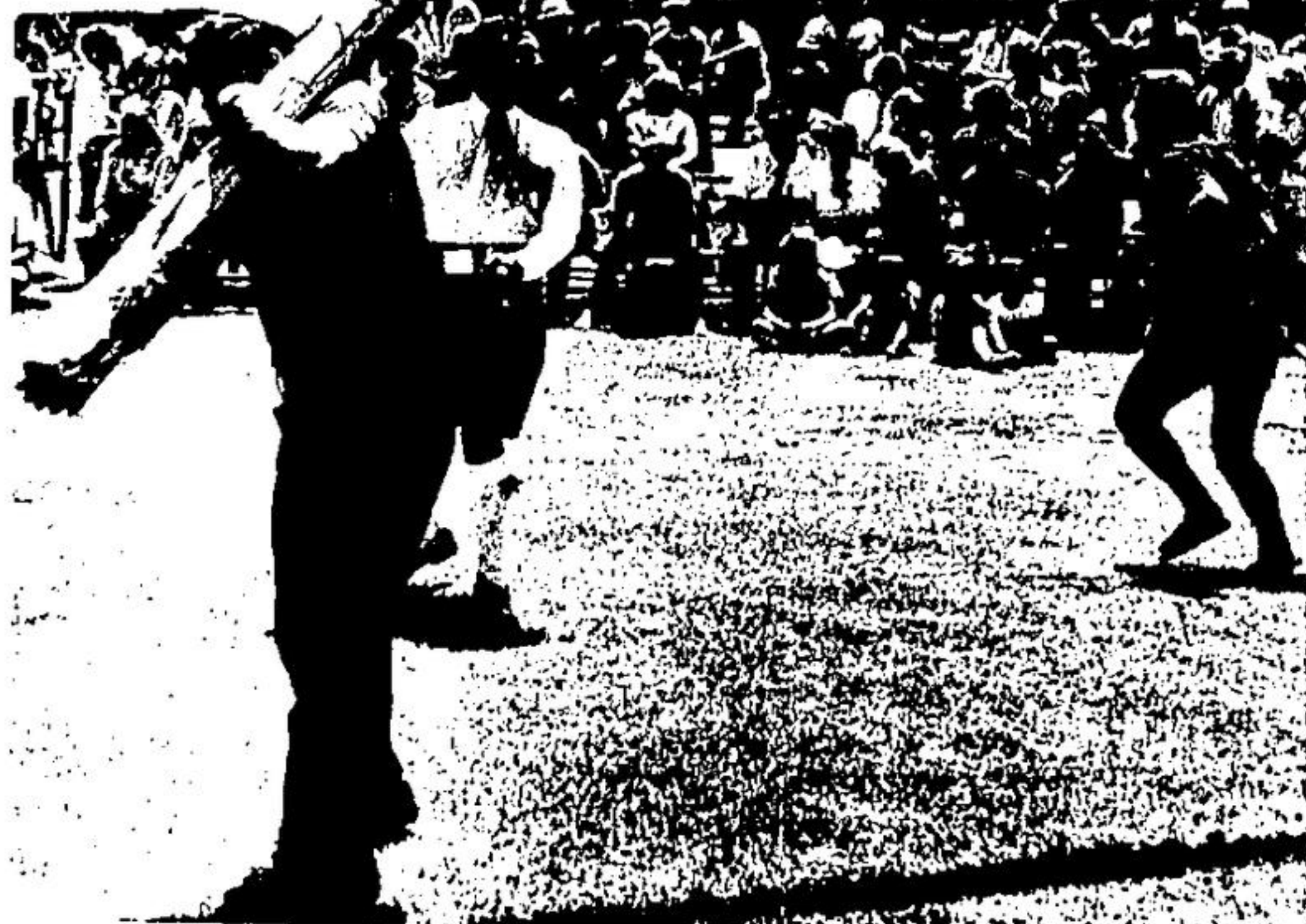
The Brampton Highland Games become the Speyside Games in Georgetown