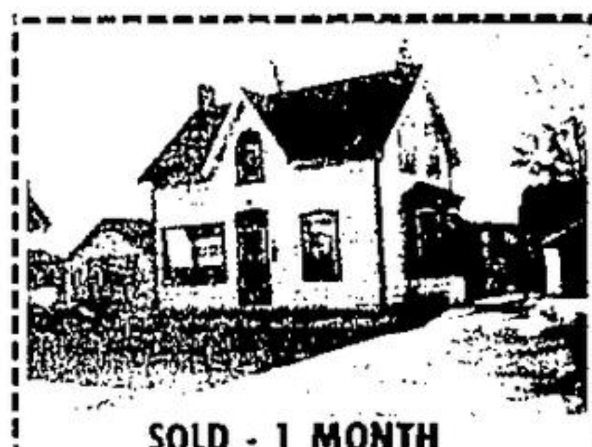
SOLD - 1 MONTH

NEEDED! Homes to sell... Sales have been good, so good that we are almost sold out. We have many buyers... all we need is your home to sell. No obligation on your part - If you are thinking of selling please give us a ring right now.