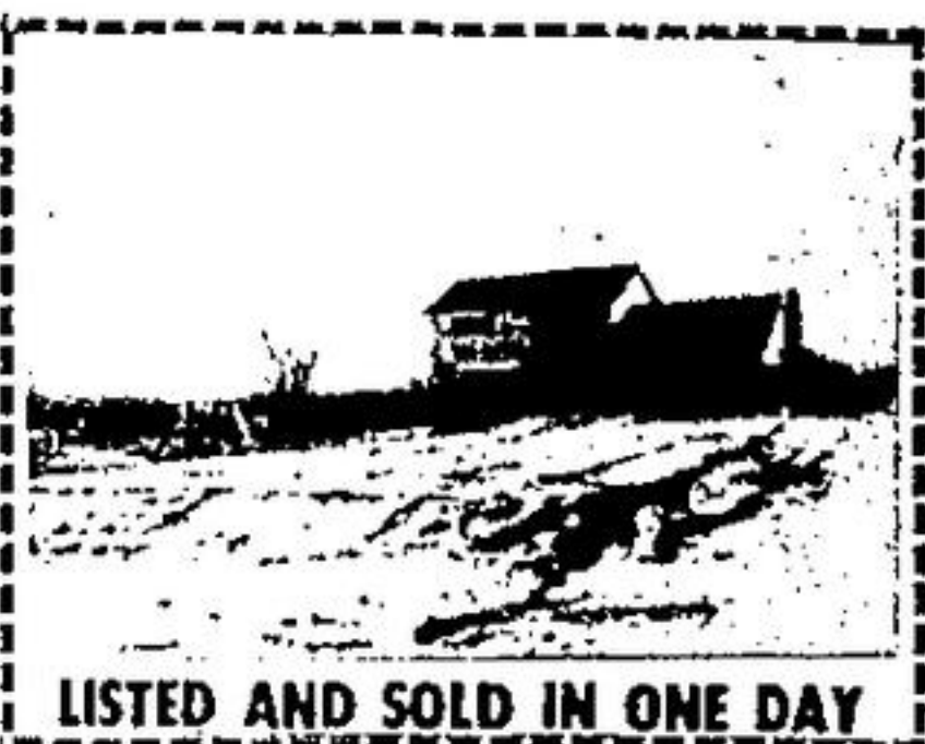
LISTED AND SOLD IN ONE DAY

ENJOY THE COMFORTS of a brand new home in beautiful Marywood Meadows. Call our office today to hear how you too can purchase one of these lovely models complete except for painting and broadloom which you choose from Builder's samples. Many Many fine features - Hurry and select the lot and model of your preference while they last. Priced from $81,500 to $92,850.