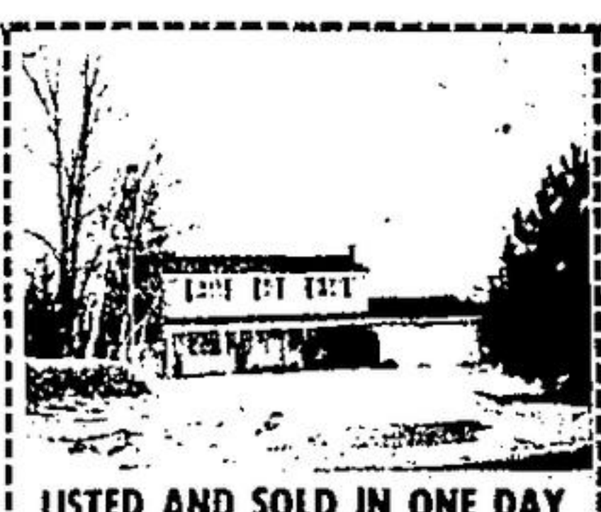
LISTED AND SOLD IN ONE DAY