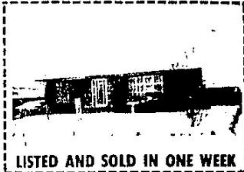
LISTED AND SOLD IN ONE WEEK

NEEDED! Homes to sell... Sales have been good, so good that we are almost sold out. We have many buyers... all we need is your home to sell. No obligation on your part - If you are thinking of selling please give us a ring right now.