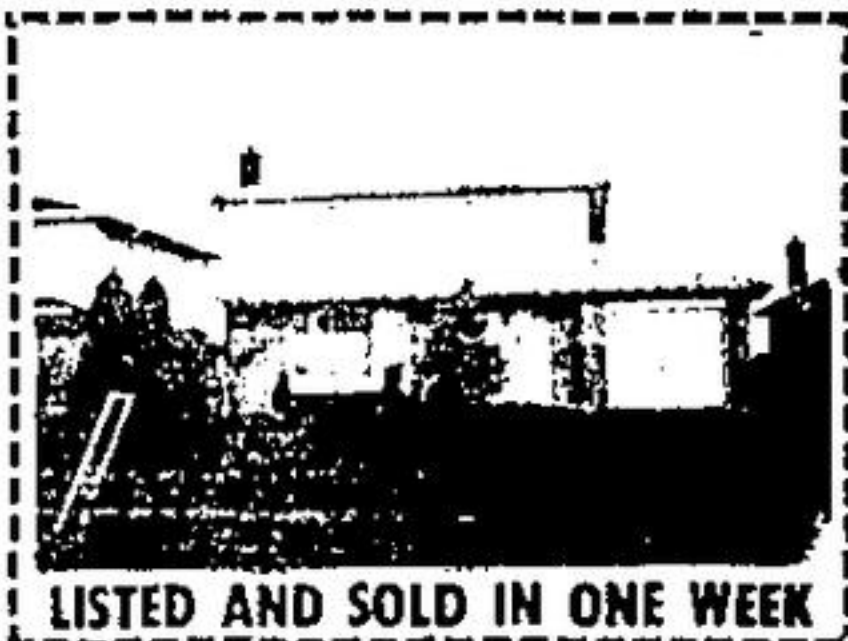
LISTED AND SOLD IN ONE WEEK