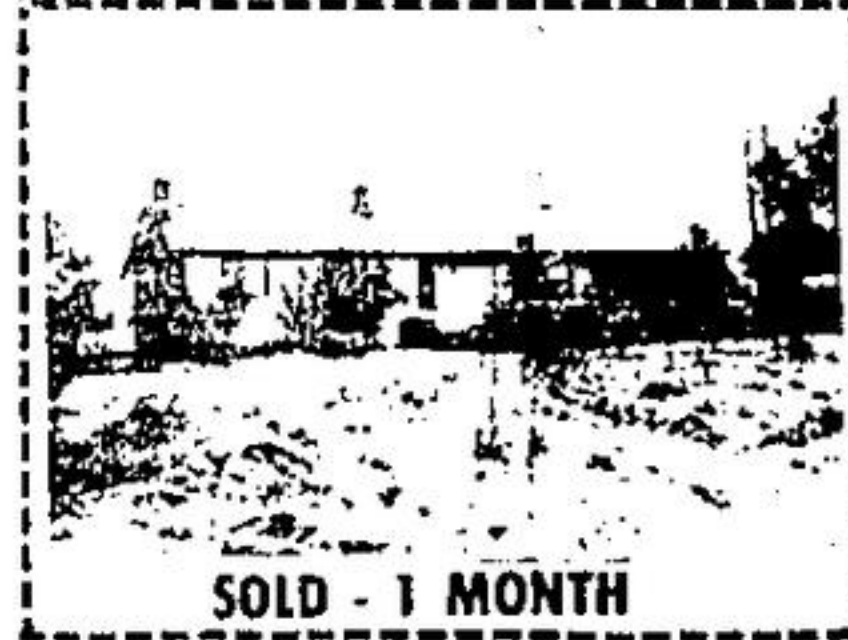
SOLD - 1 MONTH