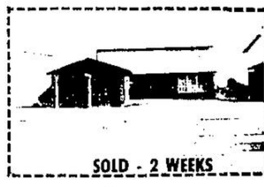
SOLD - 2 WEEKS