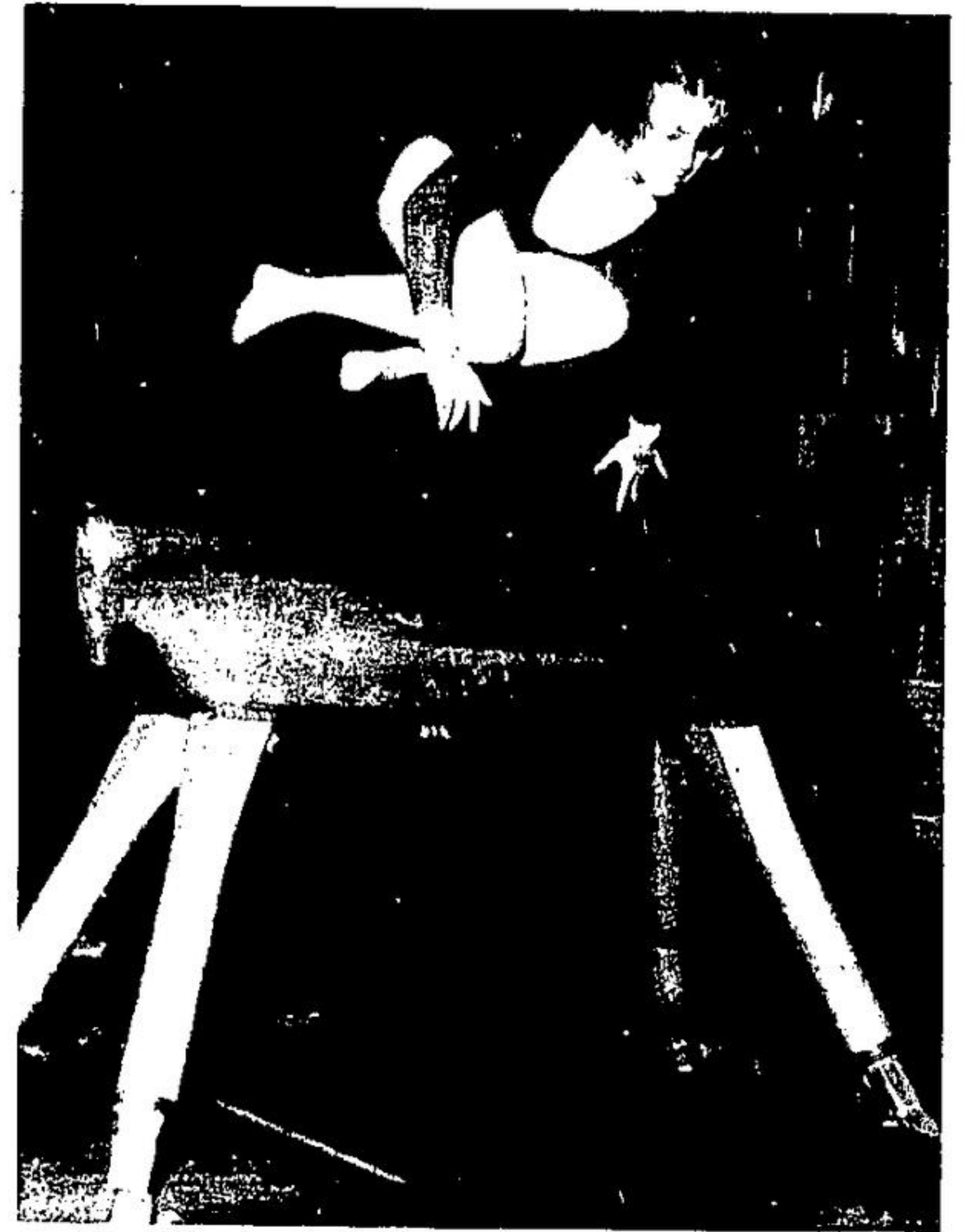
UP AND OVER AT THE GYMNASIIC MEET