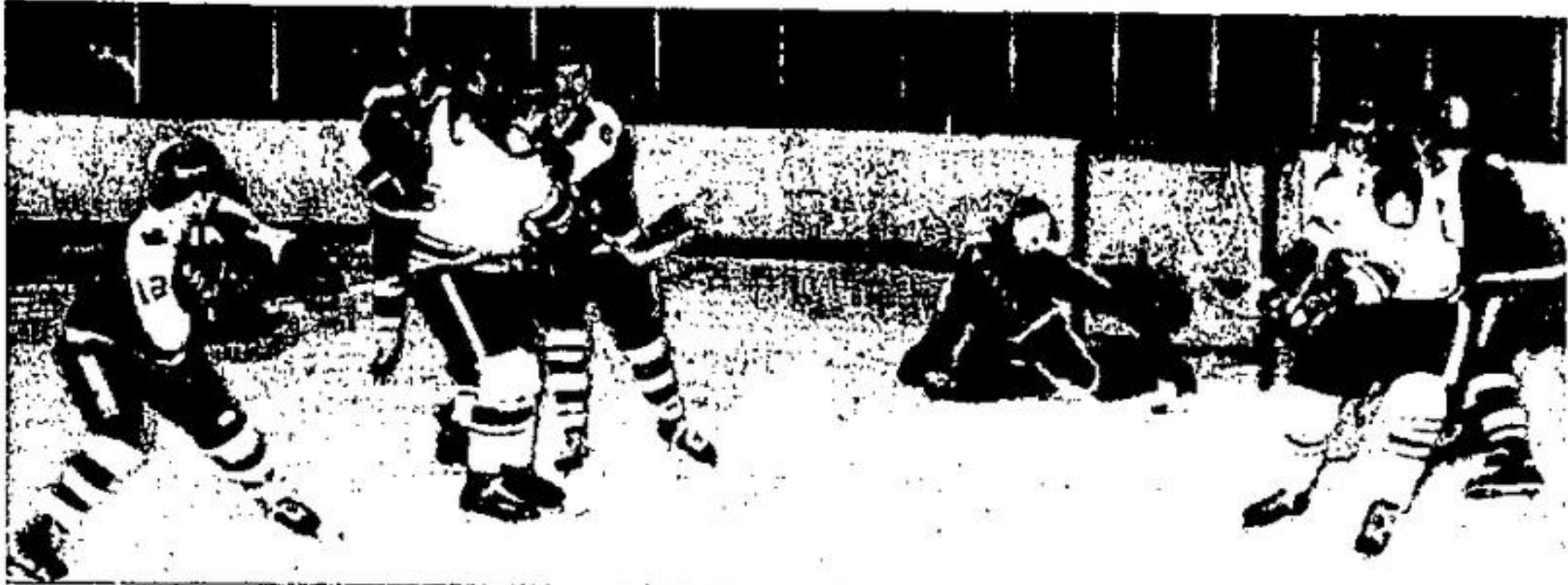
THE GEORGETOWN CHRYSLER RAIDERS score yet another goal in last Friday's home encounter with the Dunnville Mudcats. The "Cats" displayed their usual ineptness and the Raiders took full advantage to post an 8-4 win.