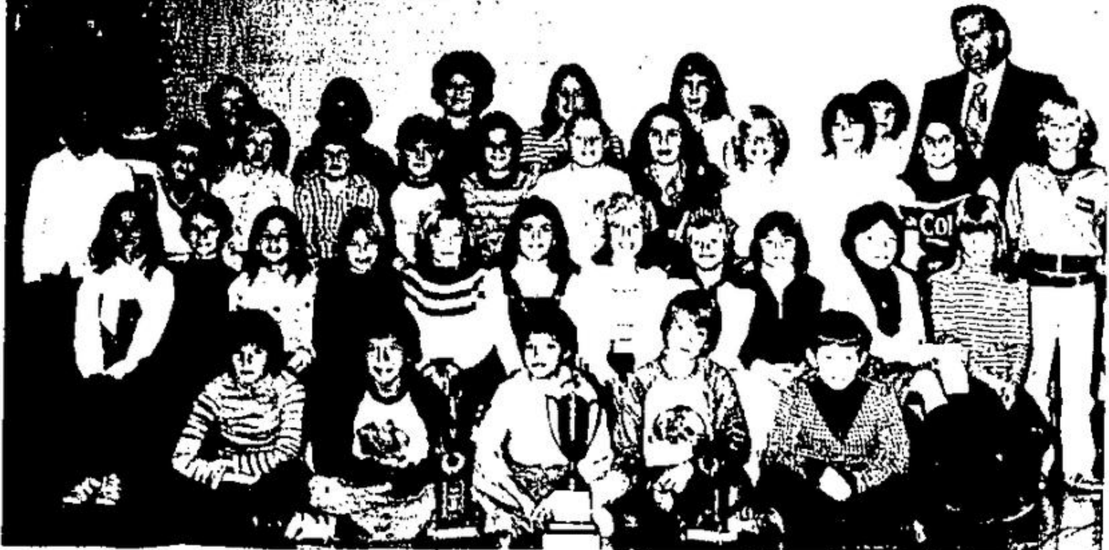
THE PINEVIEW PUBLIC SCHOOL TRACK AND FIELD TEAM, Overall Champions of the Georgetown Public