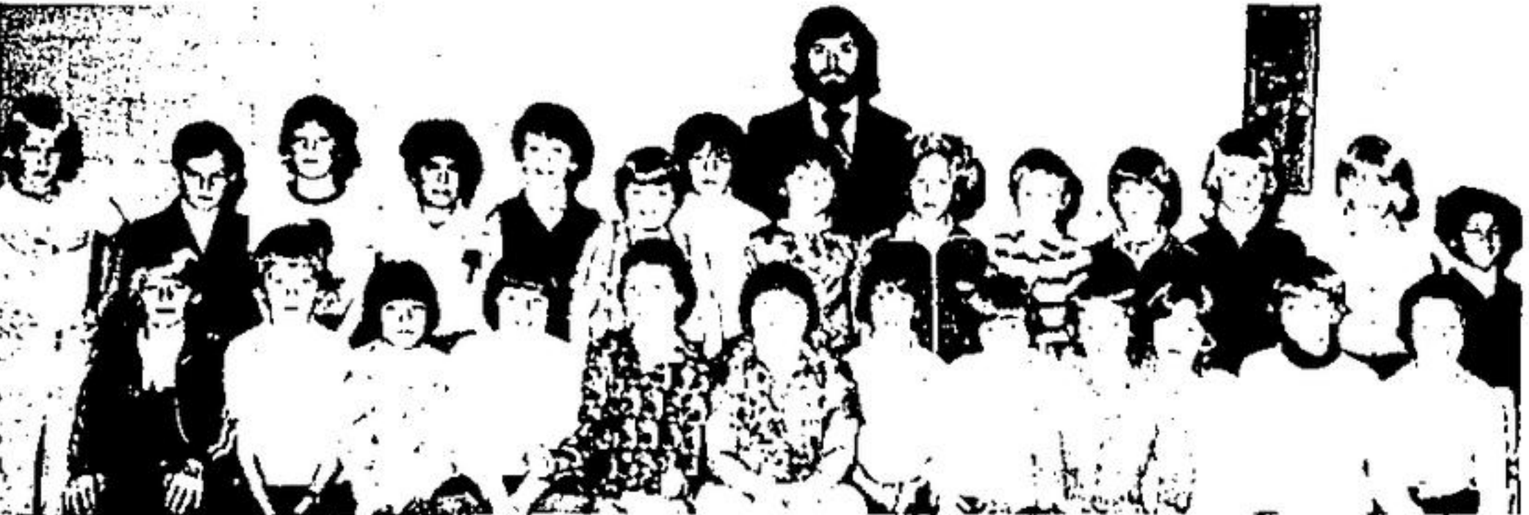
THE JOSEPH GIBBONS BOYS TEAM did well at the Public School Track and Field Meet, winning both the