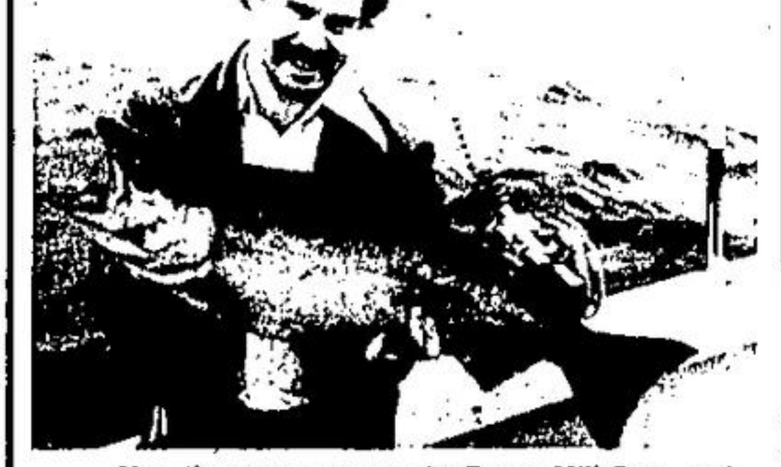
Yea, the Salmon are at the Paper Mill Dam, and have been for a couple of weeks. Watch out for poachers, spearguns and snappers. If you notice any of these, REPORT THEM!!! They are ruining our ONTARIO OUTDOORS.

Available at CPPA, 3 Church Street, Suite 407, Toronto M5E 1M2 Ontario.