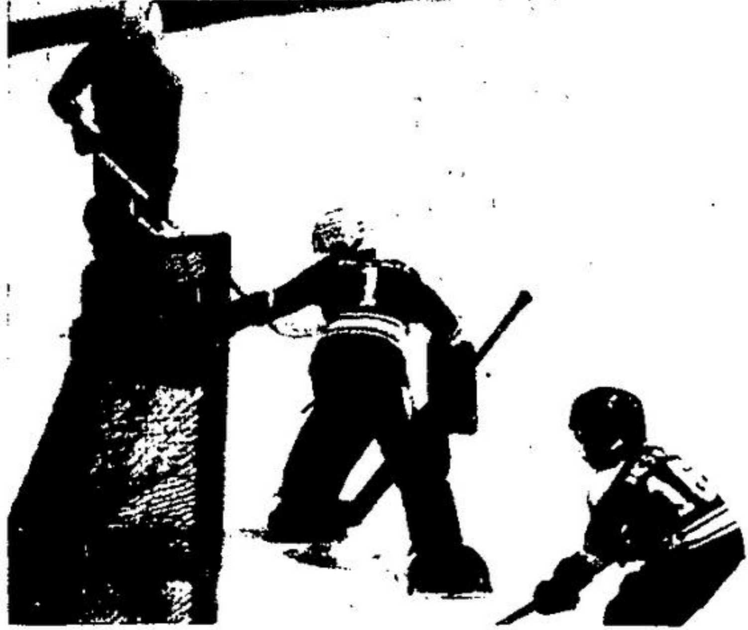
BELIEVE ME, IT'S BEHIND THE NET. ACTION IN TYKE HOCKEY.