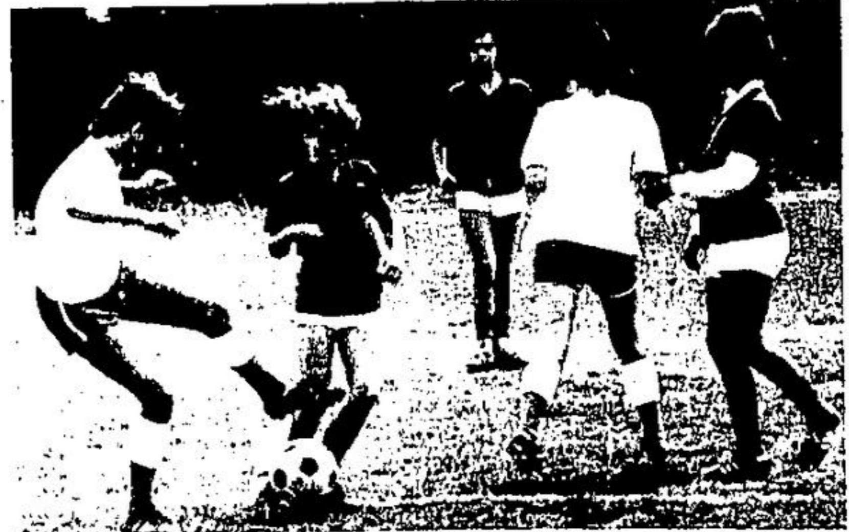
THE GEORGETOWN MINOR SOCCER Association's Final Day was held at the Cedarvale pitches last Saturday and tense