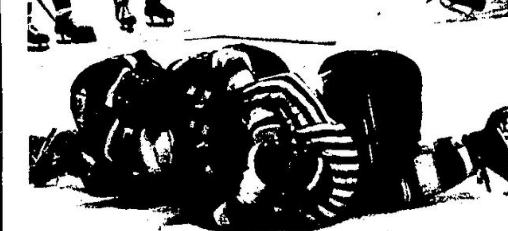
AN EXHIBITION of the absurd was more appropriate to Saturday night's exhibition game between the Georgetown Geminis and Thorold. Tussles like this one marred the game, won 14-1 by the Geminis.

Members are advised to note registration will be open to the general public after Sept. 15, 1978, so please return your applications soon. Don't forget the Skate Seminar being held at the arena on Sept. 15, at 7:30 p.m.