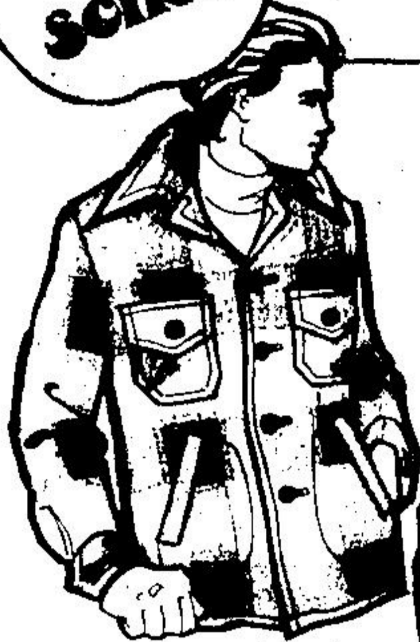
Young Men's Jac Shirt