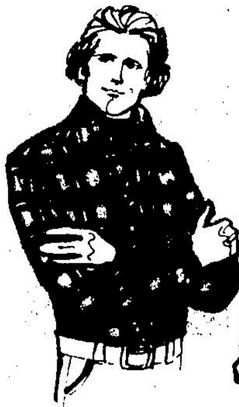
Tartan Sport Shirt

Terrific savings on famous cord! In cotton/polyester. Slightly flared. Navy, brown, tan. 26-38.