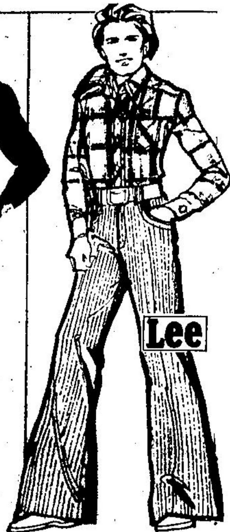
Young Men's Sport Shirt

Flare bottoms, 4 patch pockets. Canadian-made by Collection C&C. Polyester/Avril ® rayon blend. Navy, medium blue, beige, brown. 26-38.