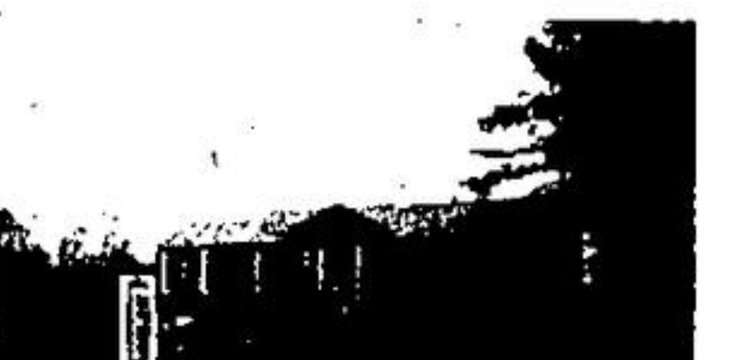
ONE ACRE BARGAIN - 5 minutes from Georgetown. 3 bedroom country bungalow surrounded by tall cedars, pond and stream on property. Come out today - only $69,500.