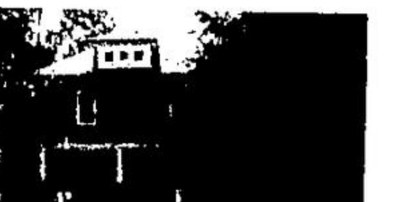
SOLID VICTORIAN home presently a duplex. Located close to High School and a short walk to Go Station. Future commercial potential. Great investment for only $59,900.