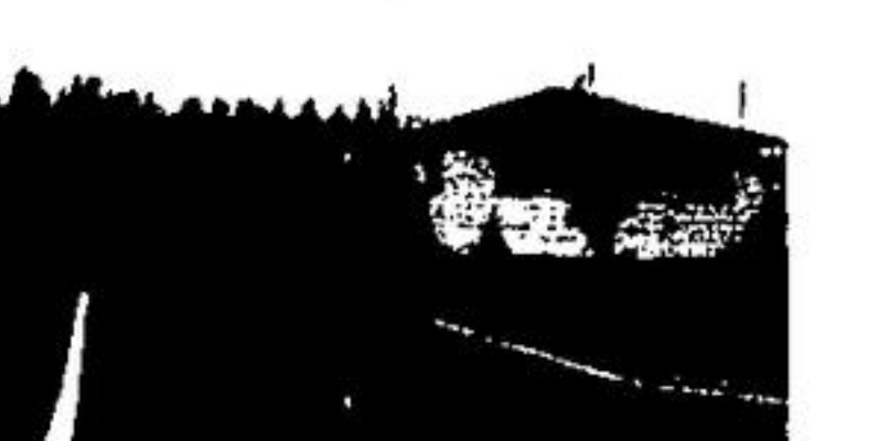
BRAND NEW LISTING!! Gorgeous, beautiful come see and compare it with anything else in Acton at this price!! Only $59,900! Call and make a date, tomorrow may be too late!!