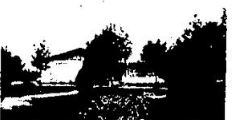
LOVELY TERRA COTTA - on the road to the Conservation Area Park sits this totally finished '5 bedroom plus' home on a scenic ACRE of land. Come out today and let us take you for the 10 minute drive. Asking $91,500.