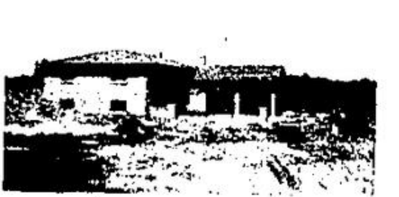
NEARLY COMPLETED - Fantastic family home on a 1/2 Acre features 1,500 sq. ft. living space on the upper level and 1,500 sq. ft. living space on the lower level. Large family room with fireplace, sliding doors to cedar balcony, FIVE bedrooms, 2 car garage. Call for details on this excellent buy. Asking $89,500.