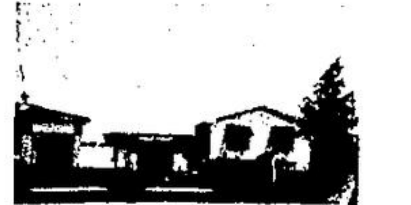
ADD YOUR FINISHING TOUCHES - to the nearly completed rec. room, 3 bedroom bungalow on a huge pie shaped lot has unique patio with gas b.b.q. and outdoor furniture included in the low price of only $65,500.