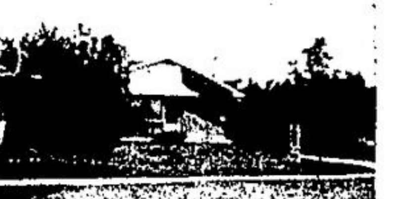
RECENTLY REDUCED - 3 bedroom bungalow with extra room, washroom, rec. room with wet bar, stone hearth and acorn fireplace. There's a nice big 16x12 kitchen as well. Now only $52,900.