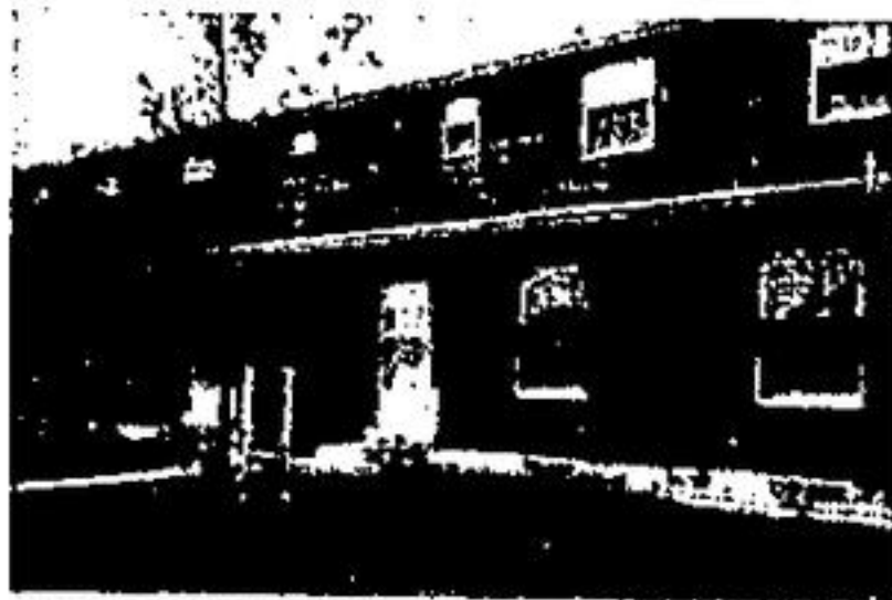
ACTON TOWNHOUSE - Large 3 bedroom home, sliding doors from dining room. Located close to schools and shopping. Excellent Mortgage: - ONLY $3,000. DOWN will buy this Gem! Asking $36,900.