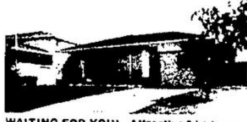
WAITING FOR YOU! - Attractive 3 bedroom bungalow finished to a 'T' with office, playroom, workshop, laundry room and rec. room all completed. Outdoors you'll find an inground pool and equipment, slide, swings and gas b.b.q. All this for only $67,900. What are you waiting for?