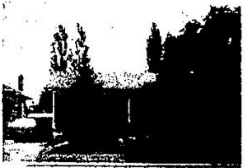
BEHIND THOSE TREES - there's a smart 3 bedroom bungalow with finished rec. room located in a lovely area. Call before this one is sold! Only $58,500.