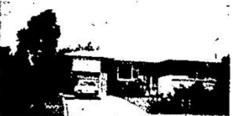
VERY APPEALING - Well constructed 3 bedroom bungalow on a lovely treed lot in an easily accessible location. Nice big kitchen, stove & frig included in the price of only $56,500.