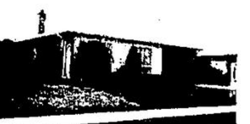
MODERN & BEAUTIFUL brick bungalow has 3 bedrooms, and separate living quarters nearly completed in the basement. Great 9 percent mortgage not due till 1991! Hurry! Priced at only $53,900.