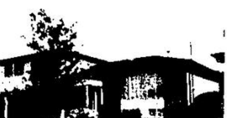
FEEL RIGHT AT HOME the moment you sink your feet into the plush broadloom in this lovely 4 bedroom family sidesplit. It's situated on a nice lot on a quiet crescent in Georgetown's Moore Park. Call for details today. Asking $69,900.