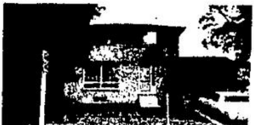
JOG TO THE GO TRAIN - from this less than a year old 4 bedroom home in a mature area of town. Vendor wants it sold quickly and reduced the price drastically. Don't miss this bargain, only $59,900.