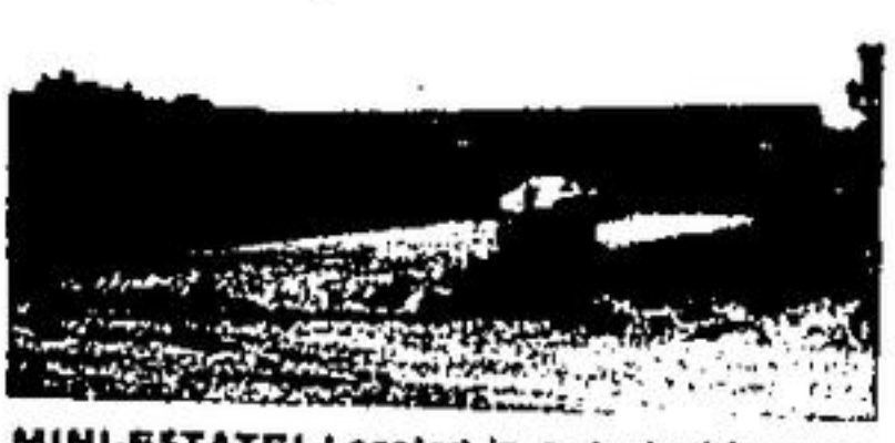
MINI-ESTATE! Located in a desirable area just south of Georgetown on 3.2 glorious acres magnificently landscaped with trees galore, a large pond which can be used for fishing or swimming, spring fed crystal clear water. The custom built long low rancher features 2,546 sq. ft. of living space with lower level walkout. Possible separation of an acre of this fantastic property. Call today - We're anxious to show it off! Asking $160,000.