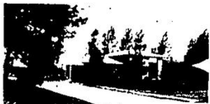
MINI FARM - FIVE ACRES. Barn with loft and paddock, completely fenced corral. Lovely sidesplit home, nicely decorated, built-in appliances, 3 bedrooms, office, rec. room. Located within easy commuting distance to 401. Priced at $134,500.