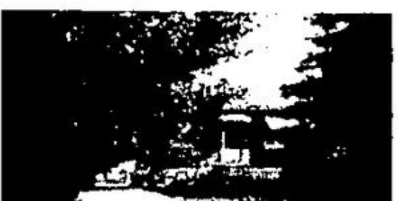
OVER AN ACRE IN TOWN! - Smart 2 bedroom home on 1.6 acres in town. Excellent development potential. Phone in for further information. $75,000.