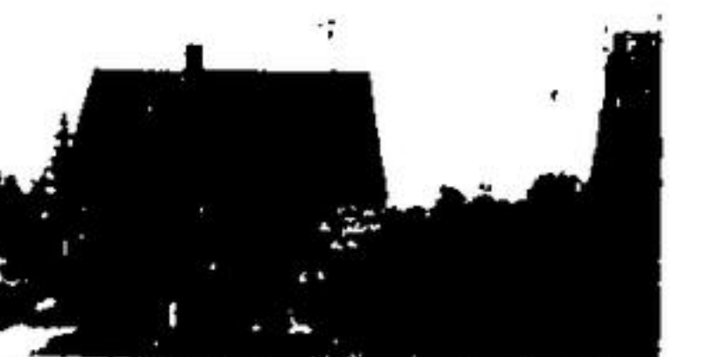
ECONOMY AND SPACE! - Just starting out or retiring? Here's a cute storey and a half 3 bedroom home on a nice big lot with vegetable garden. Easily financed and it has new aluminum siding and new kitchen floor. Only $45,900.