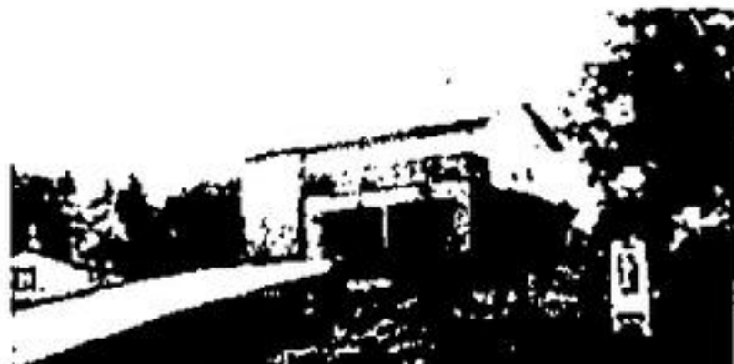
HE WANTS COUNTRY? SHE WANTS TOWN? Here's the answer! The best of both worlds with this beauty in Glen Williams. Almost an acre of land, trees, heated inground pool, 4 bedrooms, sunken living room, formal dining room, patio. You'll both love this beauty - come see it today. Priced at $119,900.