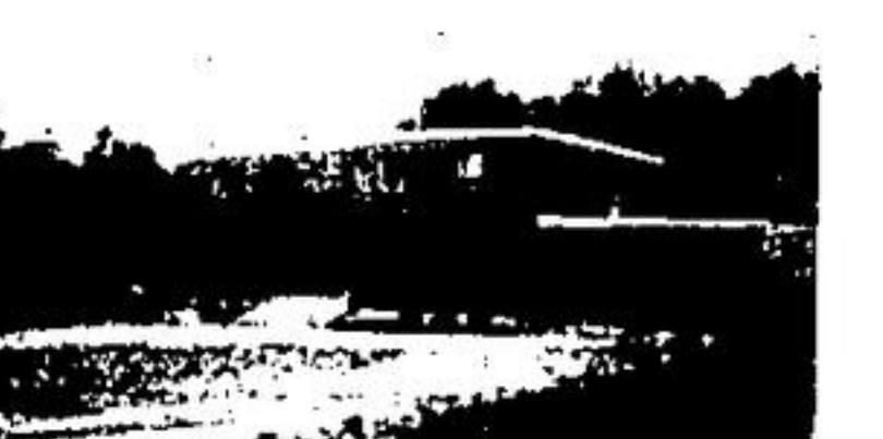
AN ACRE BACKS ONTO CREDIT RIVER - How's this for a surprise home - indoor pool, whirlpool bath, pool room, central vacuum system, 4 bedrooms plus 15 x 15 study, utility room, huge kitchen, huge double garage. You really should come and see it if you want something different! Asking Price $159,900.