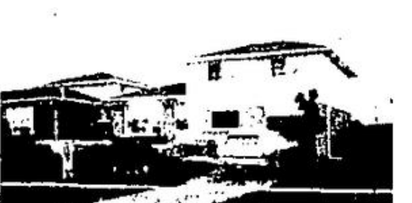
SUPER DECORATING - Professionally landscaped. Quality Broadloom. 4 brms. & den. It's really a beautiful home! Price includes a heated Fantasy pool and equipment. Dial for Details - $74,900.