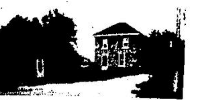
RARE OPPORTUNITY - to purchase a century old stone home on a lovely large lot just a short drive to town. Has a new roof, new aluminum eaves, nearly new furnace and septic system. Great setting for antiques or great possibilities for modern renovations. Asking $67,900.