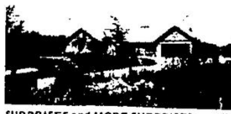
SURPRISES and MORE SURPRISES - you'll see what we mean when you come out to see this Gem in Campbellville. Fabulous 4 bedroom rancher on 3 acres features 2 old brick fireplaces, built in range, oven and b.b.q. mirrored dressing room, doors, sunken living room - It's full of pleasant living extras you are invited to come and view. $119,500.