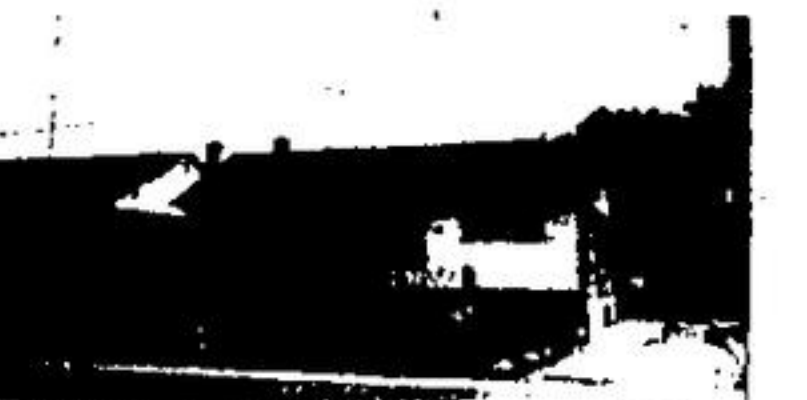
AFFORDABLE! 3 Bedroom Bungalow with extra room or den in basement. Large back yard with mature trees. A short walk to school. Only $50,900.