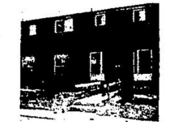
TERRIFIC TOWNHOUSE - has everything - 3 bedrooms, 3 baths, rec. room, lovely decor, fenced patio & garden backing onto parkland. Asking $41,500.