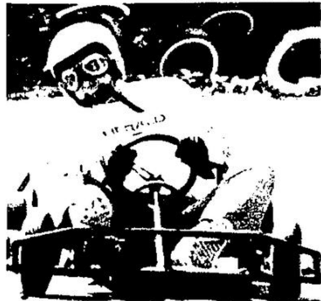
The Big E - Bill Evdokimoff corners

LIMESTONE ALL SIZES A & B GRAVEL FILL AND TOP SOIL * 'BUD' HAINES 3 DURHAM ST. 877-3302 877-4593