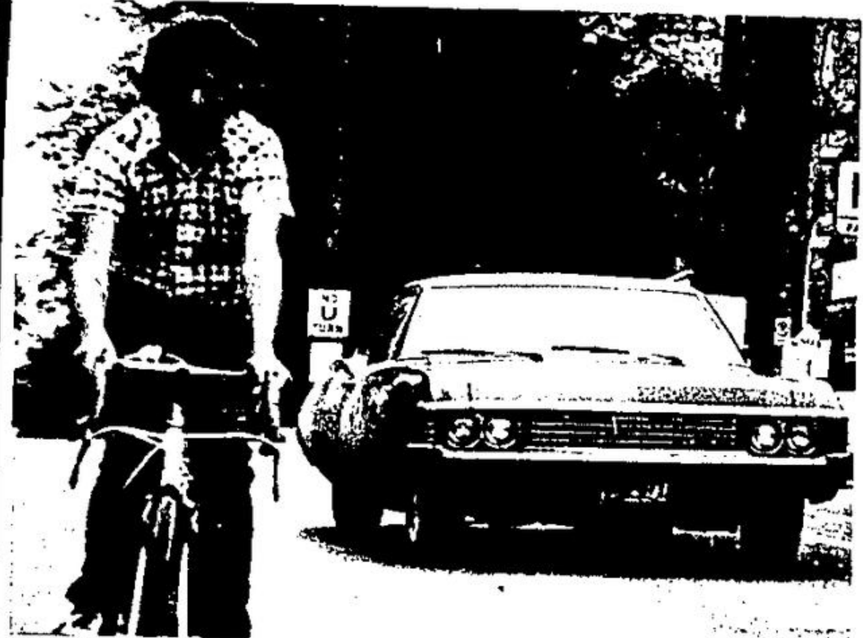
RIGHT: Bicycle riders, like motorists, must drive on the left side of the road.

Any of the four most common mistakes bicycle riders make on the road can lead to serious injury or death, says Halton Region Police.