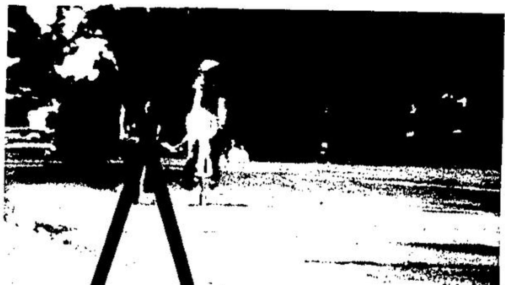
AT NIGHT in the glare of approaching headlights both bicycle riders stand out but if they were back another 100 feet, all a driver would see is the light on the bike at the right. He may not notice the rider on the left until it is too late to avoid a collision.