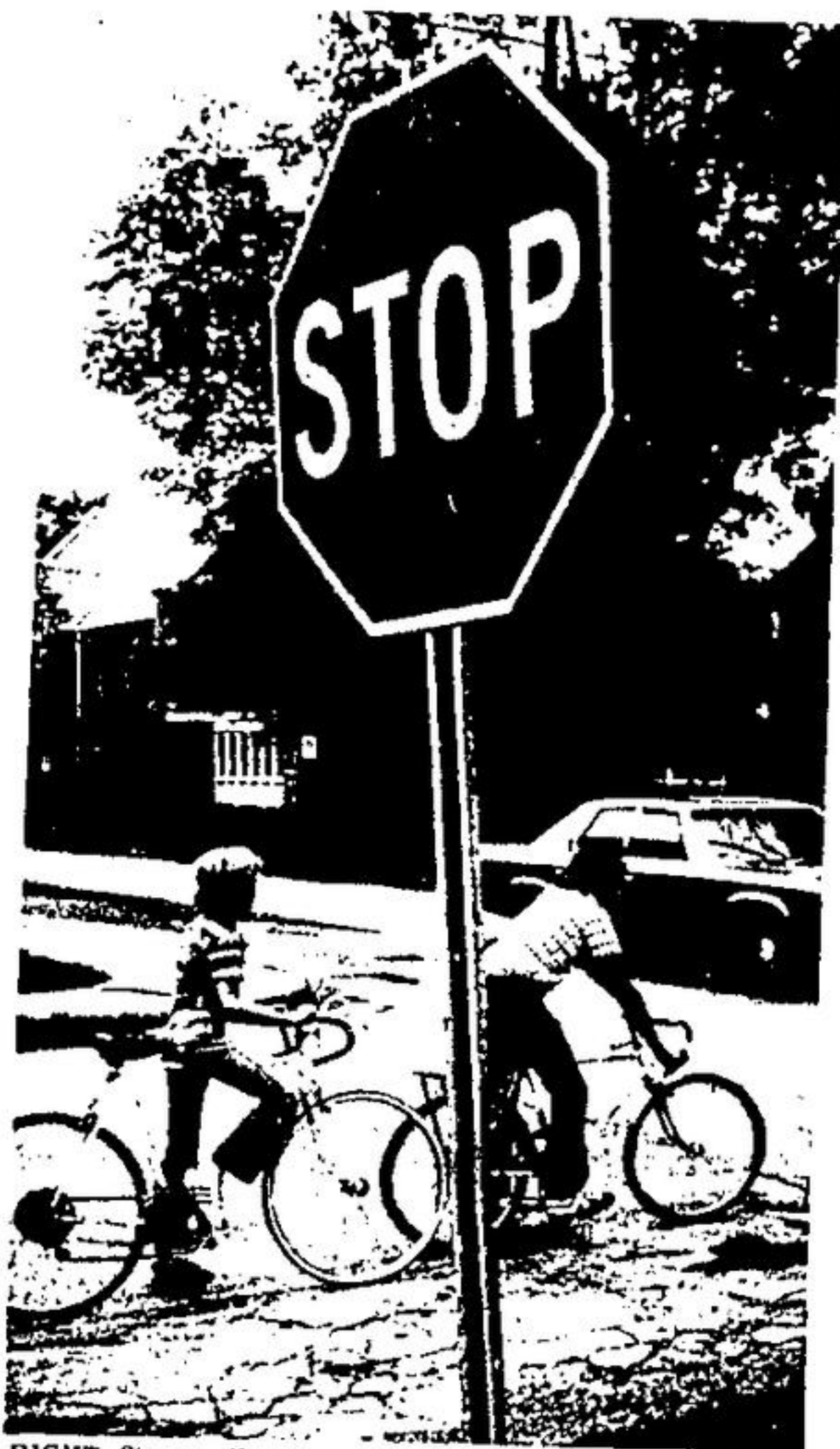
RIGHT: Stop at all stop signs.