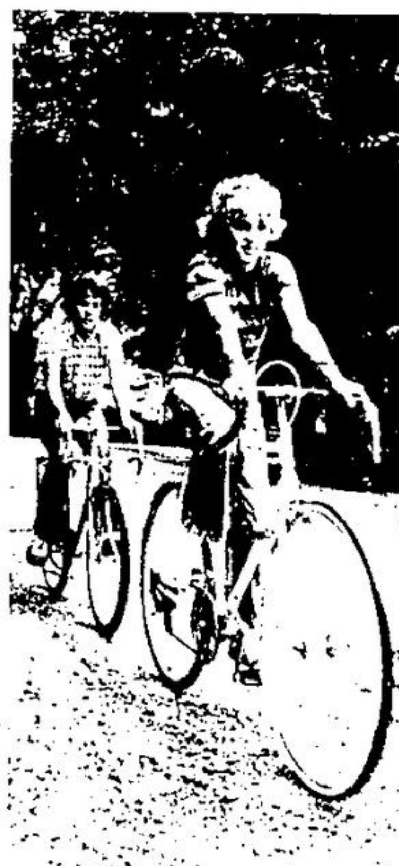
RIGHT: One rider per bike unless it's a bicycle built for two.