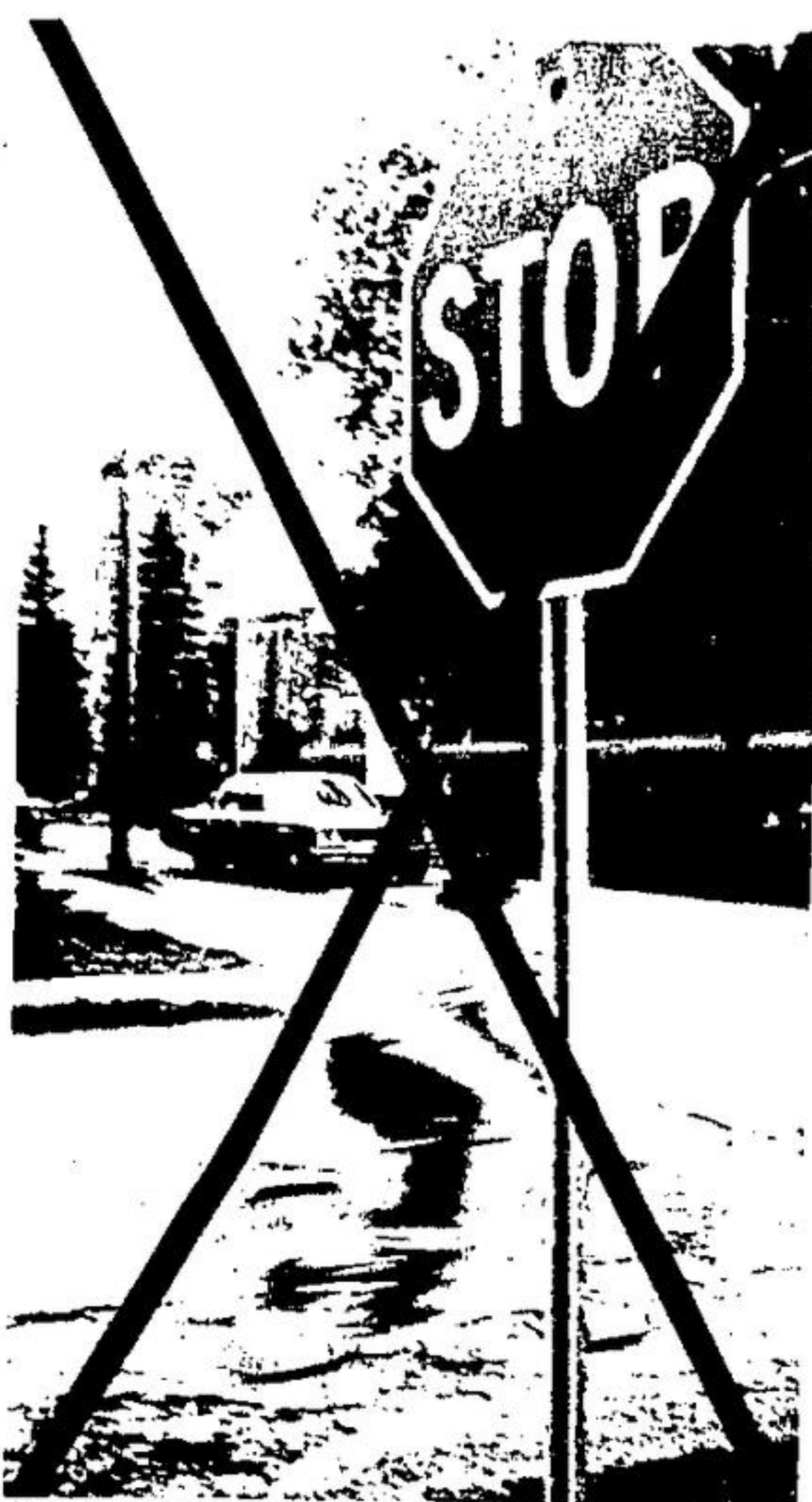
WRONG: Riding through a stop sign without stopping is wrong and can lead to serious injury.