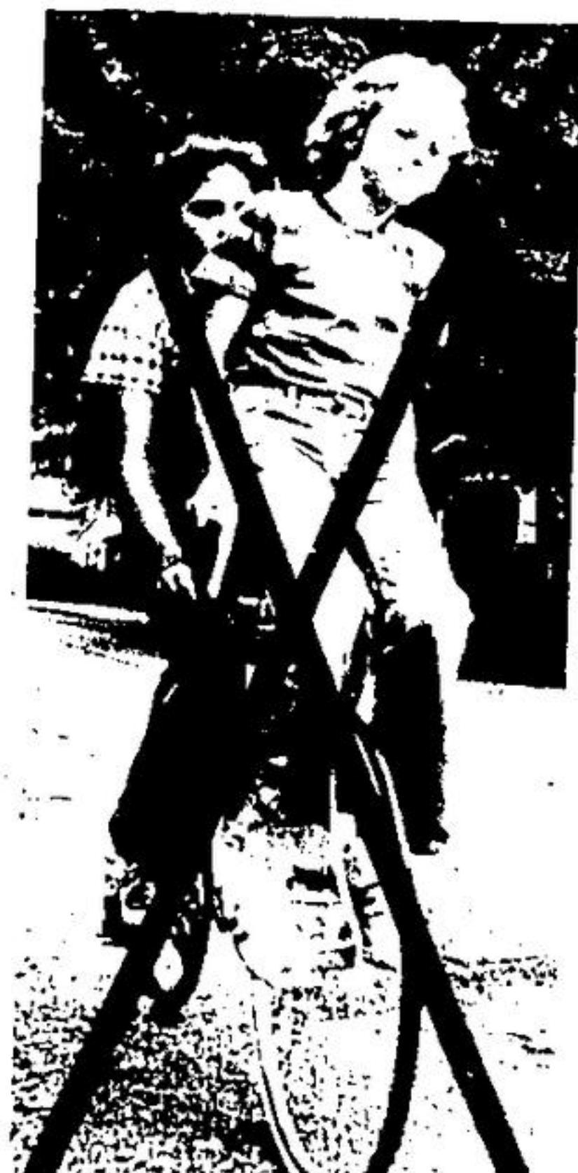
WRONG: Riding double is unsafe.