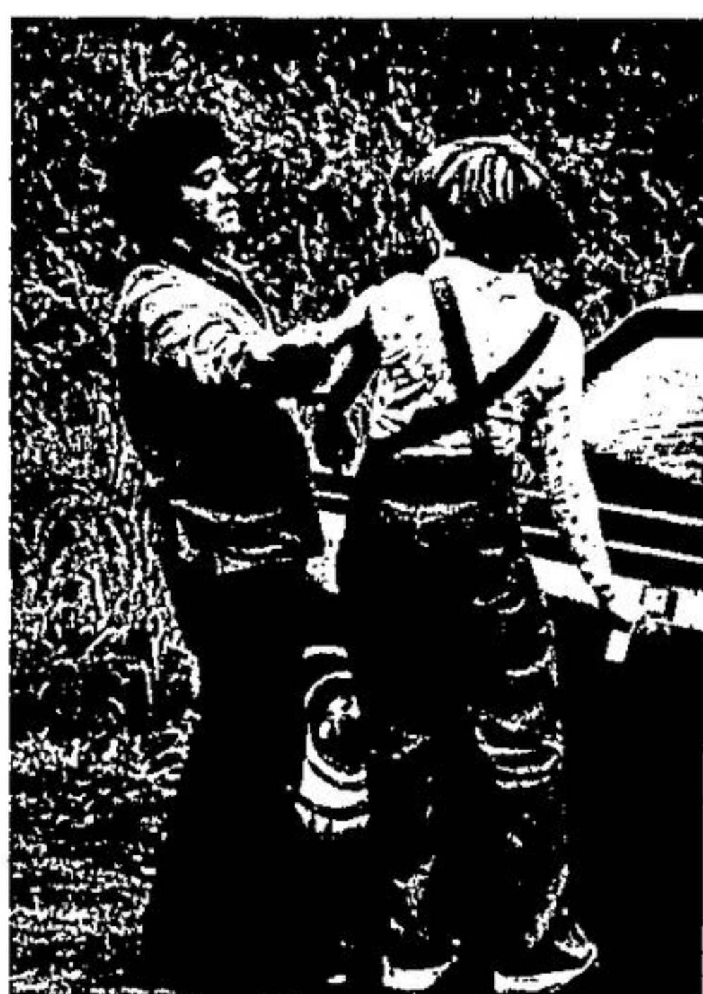
This time the Pickells are including a technique for men also.