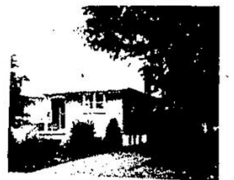
NOT FANCY - JUST HOMEY!

Another exclusive "Park District Home". Solid brick, 7 rooms, "L" shaped living and dining room with large windows and fireplace. Newly finished custom pine kitchen cupboards, broadloom throughout, exceptionally clean. Very mature, picturesque landscaping; a gardener's pride. Key-shaped heated highground pool with outside change houses. Asking $78,000. Rozetta Stolp 877-2219.