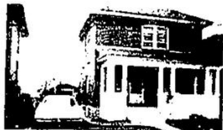
BRAMPTON M.L.S. IDEAL FAMILY HOME

Your own small orchard featuring an assortment of well maintained fruit trees, grape vines and 2 garden areas. Just north of Terra Cotta. Located on this 1 acre parcel is a frame bungalow having a kitchen, living room, 4 piece bath and 3 bedrooms. Basement has extra bedroom, cold storage room, rec room with franklin fireplace, laundry room with extra 2 piece bath and a separate door to the rear yard. Single car garage attached to house by a breezeway. Private and peaceful home and only $55,000.