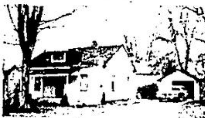
RETIREMENT FARMERS HOME

On a very quiet street. Close to all the amenities. This is a 4 Bedroom 1 1/2 storey stucco home. Living Room with open staircase, eat in kitchen and mud room. Large detached garage. Asking $57,500.