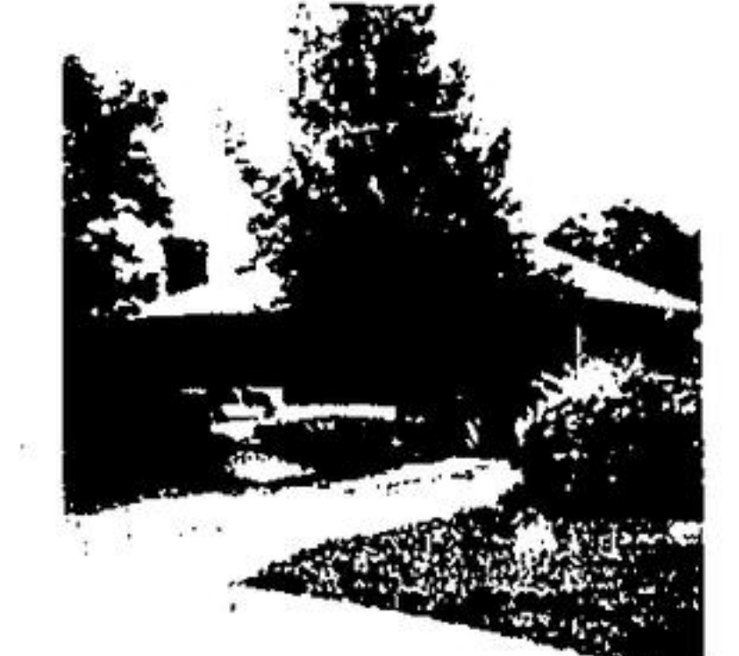
FOR THE CHOOSY FAMILY!

Only 4 years old, 3 bedroom back-split large eat-in kitchen, broadloom, family room with fireplace, office for the business man and convenient additional two piece wash near finished laundry area. Call Rozetta Stolp 877-2219.