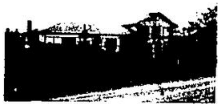
PICTURESQUE TERRA COTTA

Stucco side-split on 98x178 lot. Features 2 bedrooms, family room, 4pc bath and ultra-sized living room with sliding glass doors to cedar deck and rear yard. Possible 3rd bedroom in basement. Well landscaped and backing onto acres of open land. Priced at $19,000.