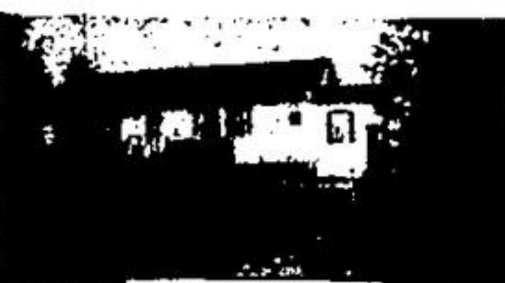
1 ACRE OF PRIVACY

Stucco side-split on 98x178 lot. Features 2 bedrooms, family room, 4pc bath and ultra-sized living room with sliding glass doors to cedar deck and rear yard. Possible 3rd bedroom in basement. Well landscaped and backing onto acres of open land. Priced at $19,000.