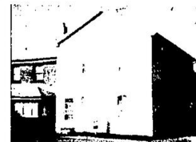
HERE'S A SURPRISE!!!