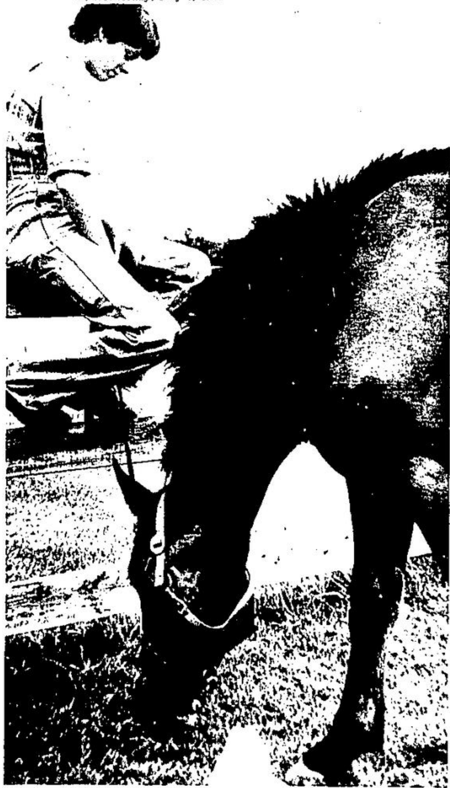
ALISTON ADAM, 13, a groom with Maple Valley Stables minds Ben, a jumper, during the Hornby horse show last week.