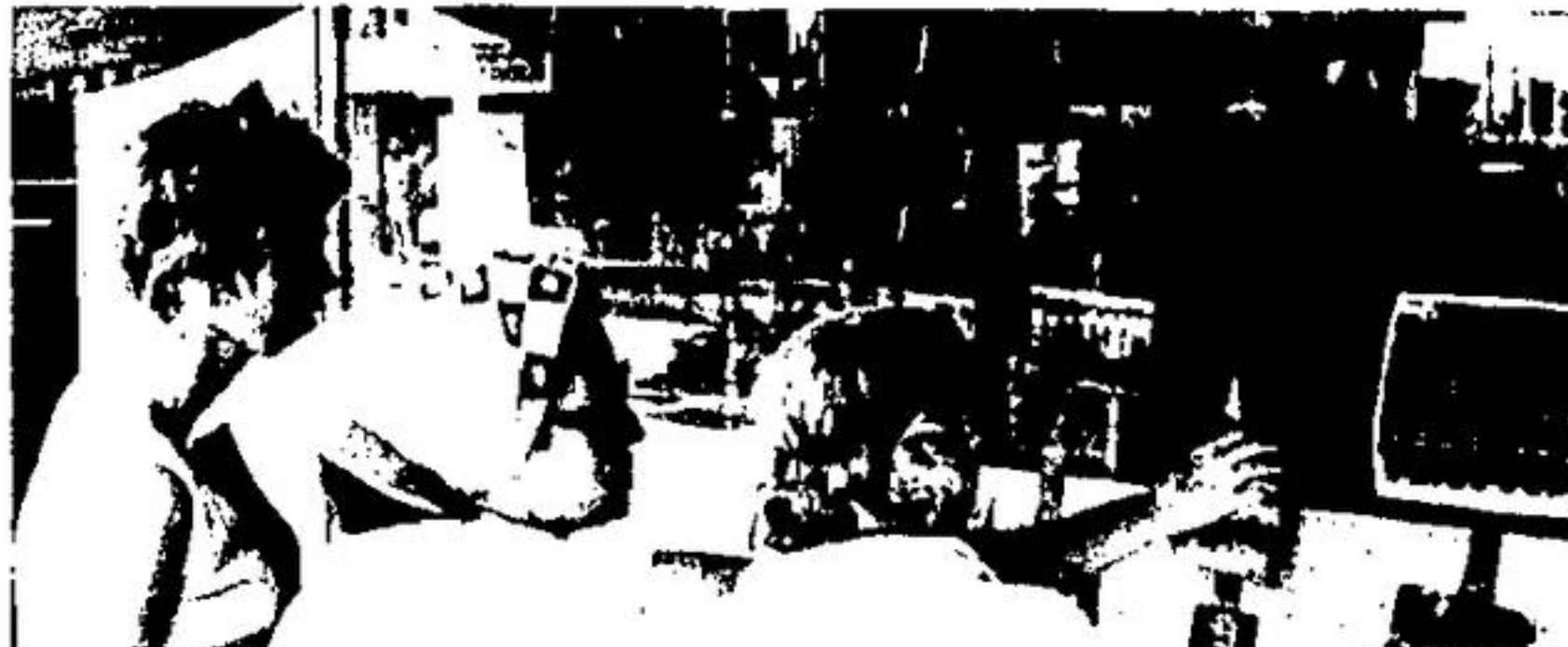
PICTURES FROM THE FILES of the Herald drew a crowd of people looking for themselves and relatives in scenes of days gone by.