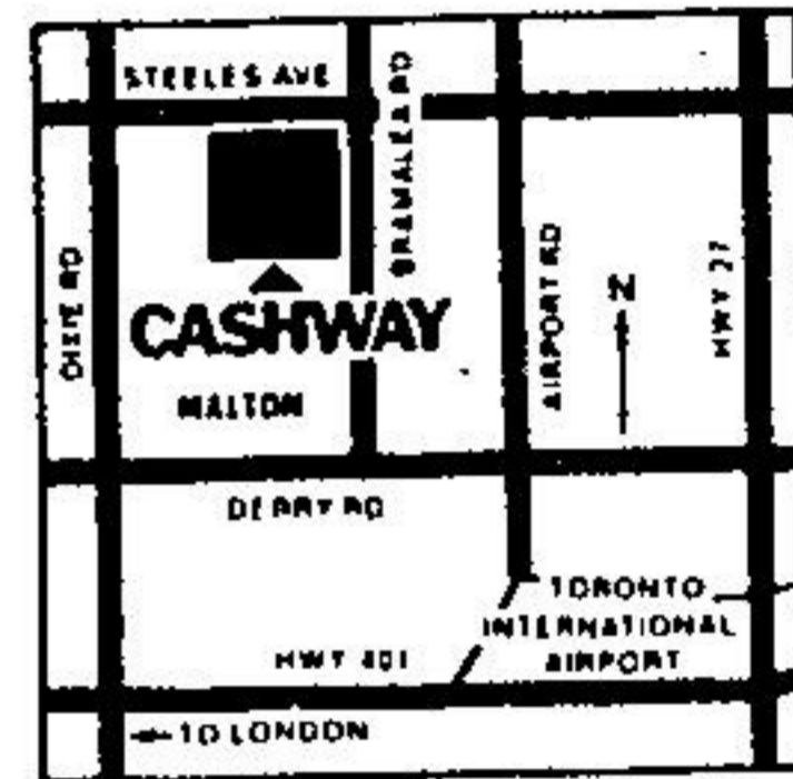
BRAMALEA/MALTON Bramalea Rd. At Steeles, 1 mile north of Airport.

SAVE! 1" DELUXE 1-LITE BROWN DOORS 2'8" x 6'8" $4484 OR 2'10" x 6'10" $4484 EACH Safety Tempered glass with separate screen.