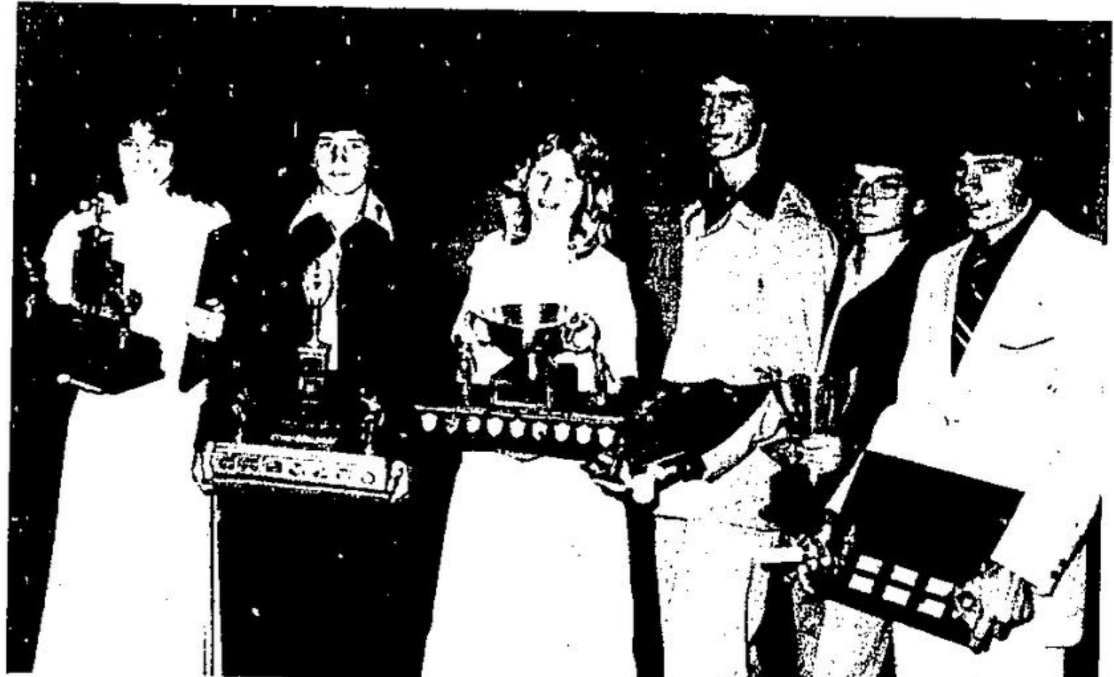
Stewarttown award winners