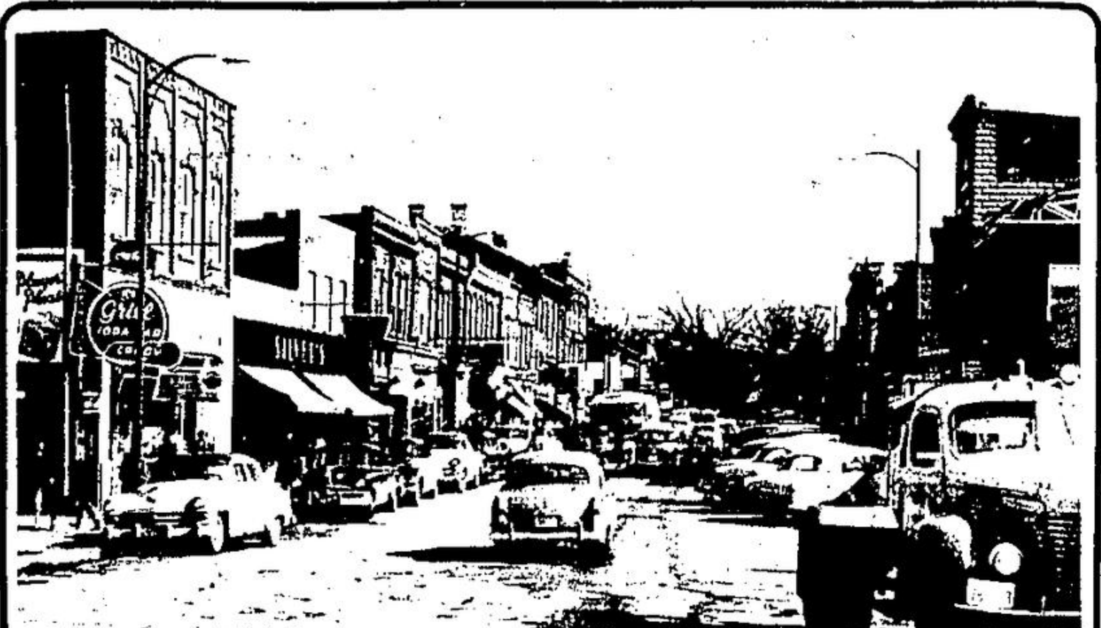
...and now (sortof)

rooms or gyms or science labs or cafeterias. No PA systems or swimming pools or audiovisual equipment. No plumbing.