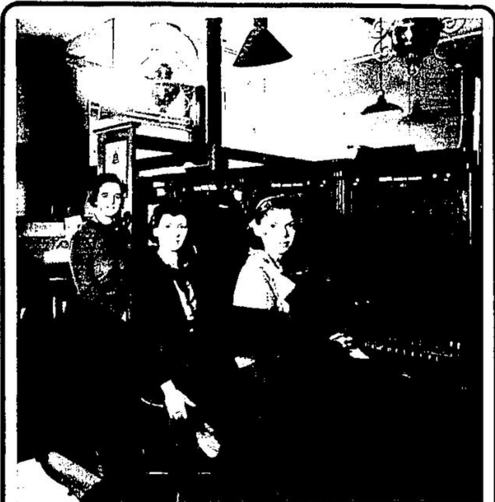
Early days at the telephone exchange

12 August 1925 (A question in a local news item column) Who was it who recently said that the cost of living was like an evening gown, it looks as if it was going to come down, but it doesn't.