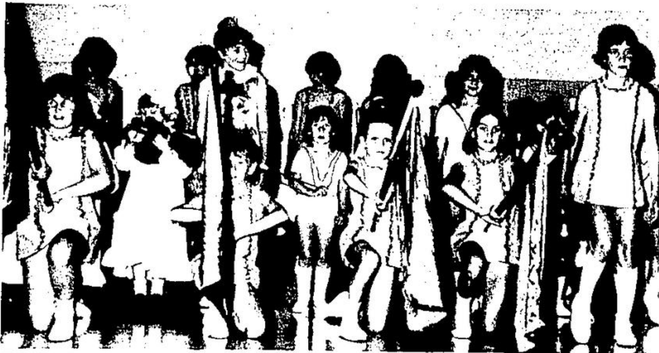
THE GRAND FINALE of the Georgetown Majorettes recital Friday night at Holy Cross school saw all members on stage.

year to help Centennial School music students.