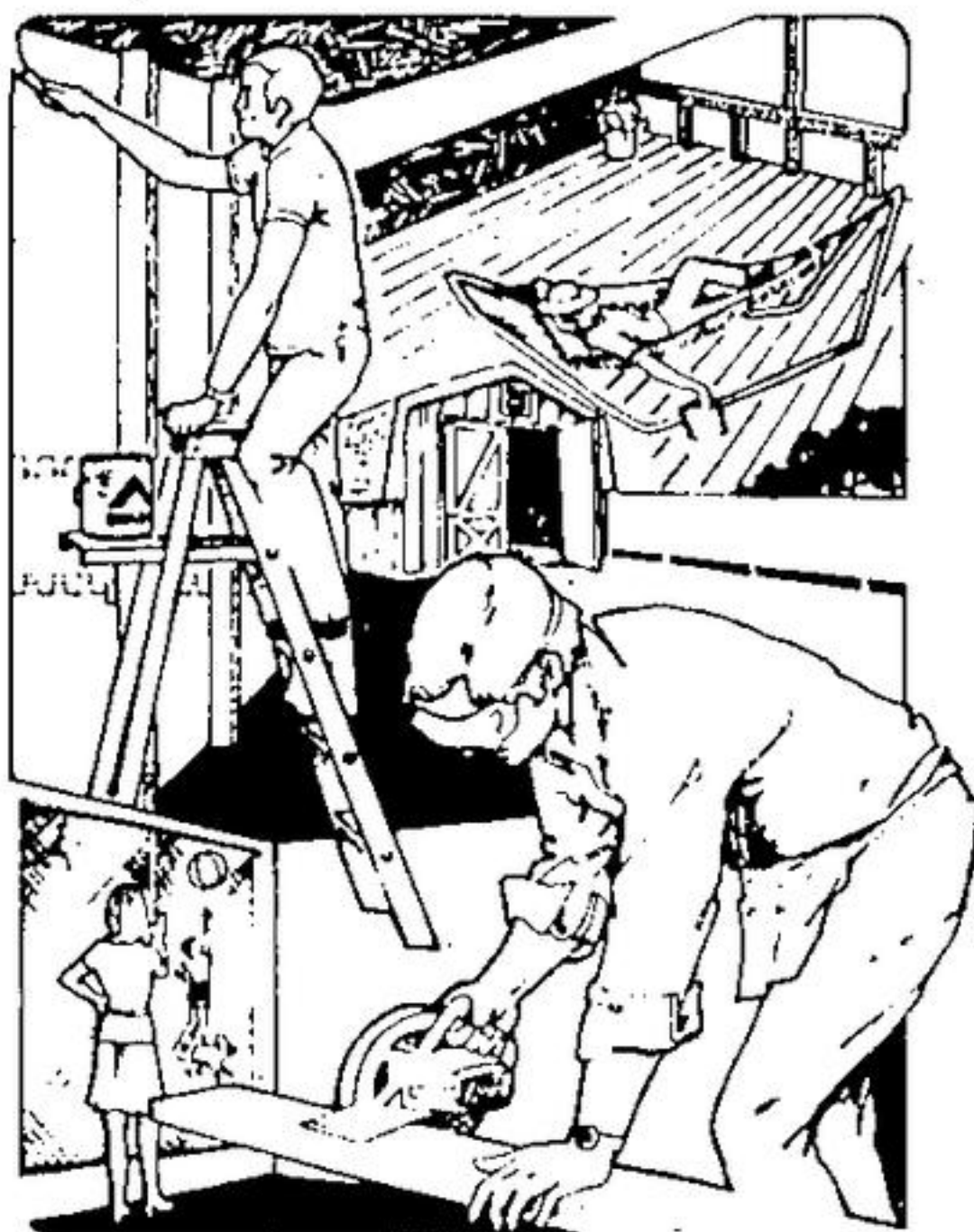
Cash & Carry Prices PRICES GOOD TILL JUNE 19, 1976

The entry which follows upon the win of the Central Canada region will be placed in the international competition of the Radio and Television News Directors Association.