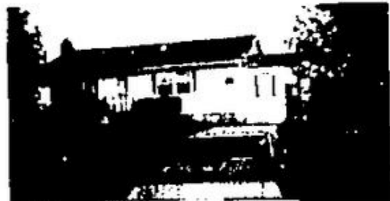
1 ACRE OF PRIVACY

Stucco side split on 28x198 lot. Features 2 bedrooms, family room, 4 pc bath and ultra sized living room with sliding glass doors to cedar deck and rear yard. Possible 3rd bedroom in basement. Well landscaped and backing onto acres of open land. Priced at $59,900.