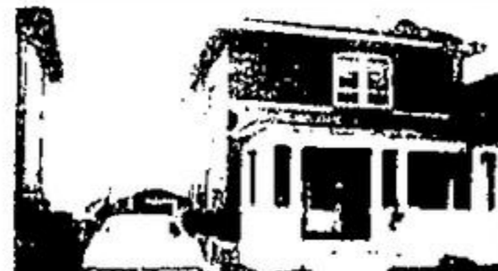
BRAMPTON M.L.S. IDEAL FAMILY HOME

Spend the warm summer evenings on the shady verandah of this 2 storey brick home, situated on a country quiet street in an area of well kept homes, containing large family kitchen, separate dining room, living room, 3 piece bath, and 3 good sized bedrooms, with loads of closets. Close to schools & shopping. Priced to sell at $54,900.00