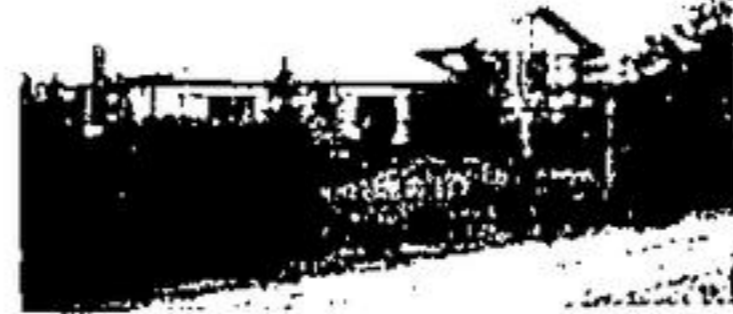
PICTURESQUE TERRA COTTA

& INSURANCE LIMITED 122 Guelph St., Georgetown