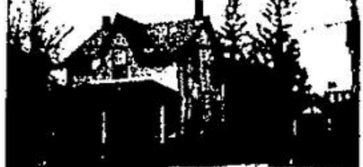
OLDER FAMILY HOME

Stucco side-split on 98x198 lot. Features 2 bedrooms, family room, 4 pc bath and ultra-sized living room with sliding glass doors to cedar deck and rear yard. Possible 3rd bedroom in basement. Well landscaped and backing onto acres of open land. Priced at $59,900.