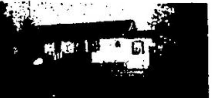
1 ACRE OF PRIVACY

This older 4 bedroom home has a kitchen, par. y., formal dining room with well-enclosed sliding doors to living room, den, rear wood shed and a single car garage on 66 x 132 lot. Large amount of Oak trim throughout. Old fashioned high ceilings, open decorative stairway and tile-faced fireplace along with random-width wood flooring. Needs renovation. Asking $52,500.