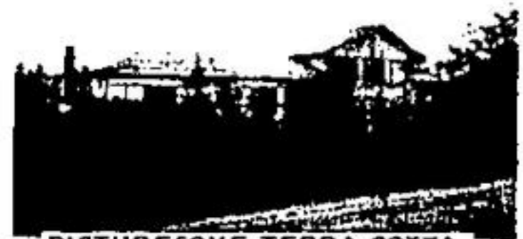
PICTURESQUE TERRA COTTA

Stucco side-split on 98x198 lot. Features 2 bedrooms, family room, 4 pc bath and ultra-sized living room with sliding glass doors to cedar deck and rear yard. Possible 3rd bedroom in basement. Well landscaped and backing onto acres of open land. Priced at $59,900.