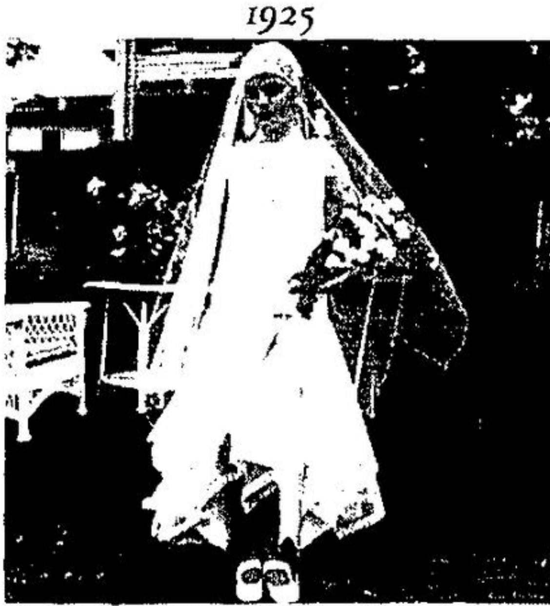
1925 IN 1925 FOR THE FIRST TIME in fashion history, the dress rose to the knees. This gown designed for the liberated bride of that year is made of ivory silk organza and rosaline lace. The chemise silhouette has a handkerchief neckline, bateau neckline and a handkerchief capelet.

Chances are newlyweds will not be purchasing all of their furniture before they settle in their first