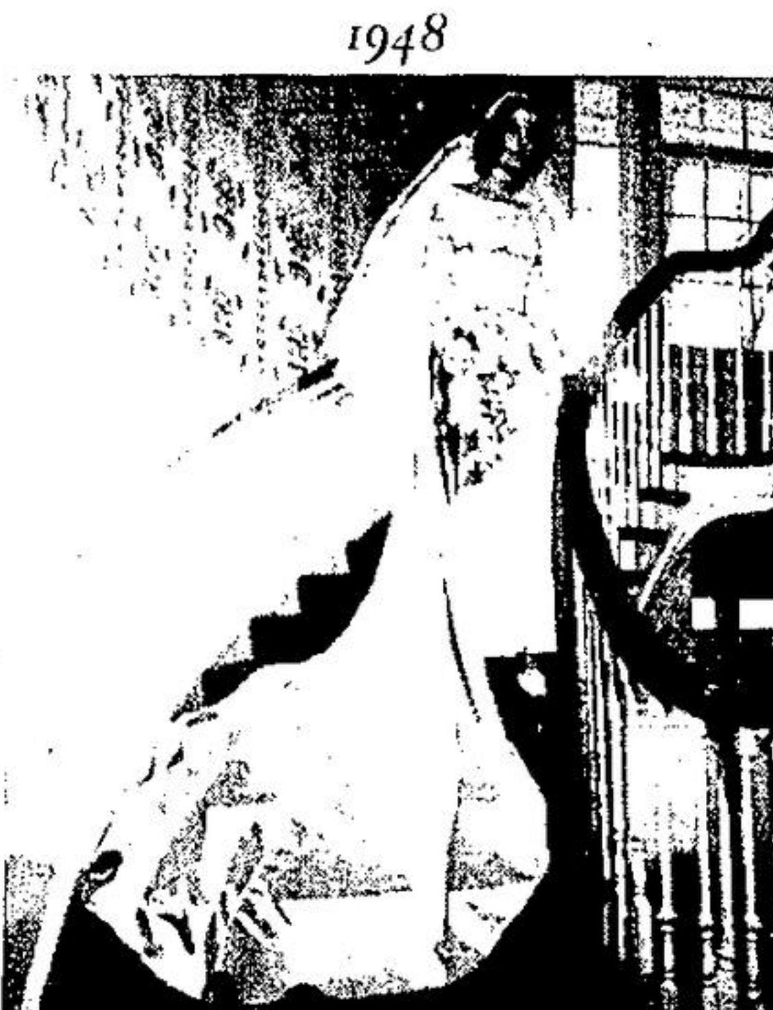
1948 IN 1948 THE FIRST GOWN manufactured by Priscilla of Boston was shown in the Pennsylvania Hotel and Macy's New York was the first retail store to buy it. The gown was made of ivory skinner satin with a two and a half yard train.