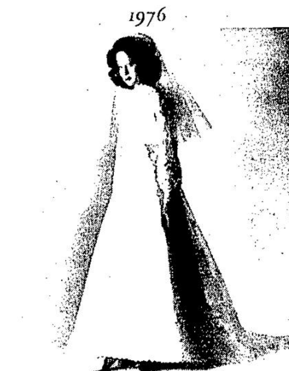
1976 THE MODERN BRIDE OF 1976 reflects many of the traditions of her counterpart 200 years ago, proving that elegance is ageless. Here, bouquets and blossoms of white lace pattern a wedding band neckline with a molded bouquette. By Priscilla of Boston.

apartment. In fact, they'll probably be filling in with pieces borrowed from parents and relatives. If this situation applies to you, here are some handy do-it-yourself decorating hints.