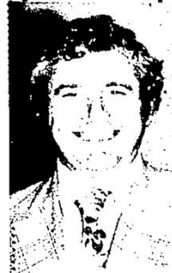
by Julian Reed MPP, Halton- Burlington

Quite a number of businessmen, especially tenants of shopping plazas, have expressed concern about the amendment to the Assessment Act which was passed in 1974. Until that time, assessment was based on the actual area occupied by a tenant, but the new formula is based on the total assessment value of the entire tenant-occupied property (for example a plaza) divided among the tenants in proportion to the fair market rent of the space they each occupy. This means, in effect, that the tenant who pays a higher rent will also be paying higher taxes.