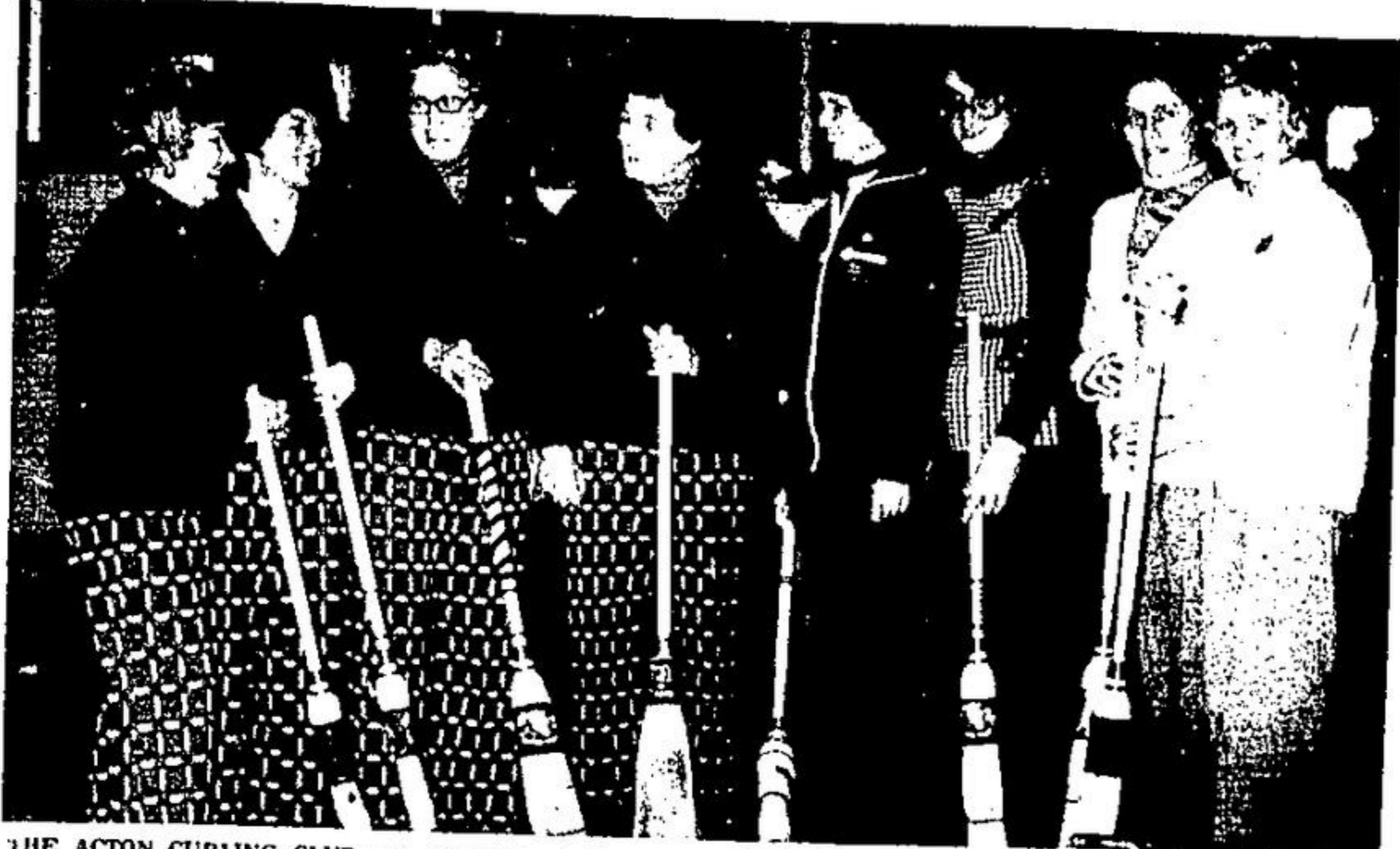
THE ACTON CURLING CLUB was the scene of the Tankard Bonselpiel last week and this area was represented by men teams from the North Halton Golf and Country Club, The North Halton Ladies, shown here prior to their