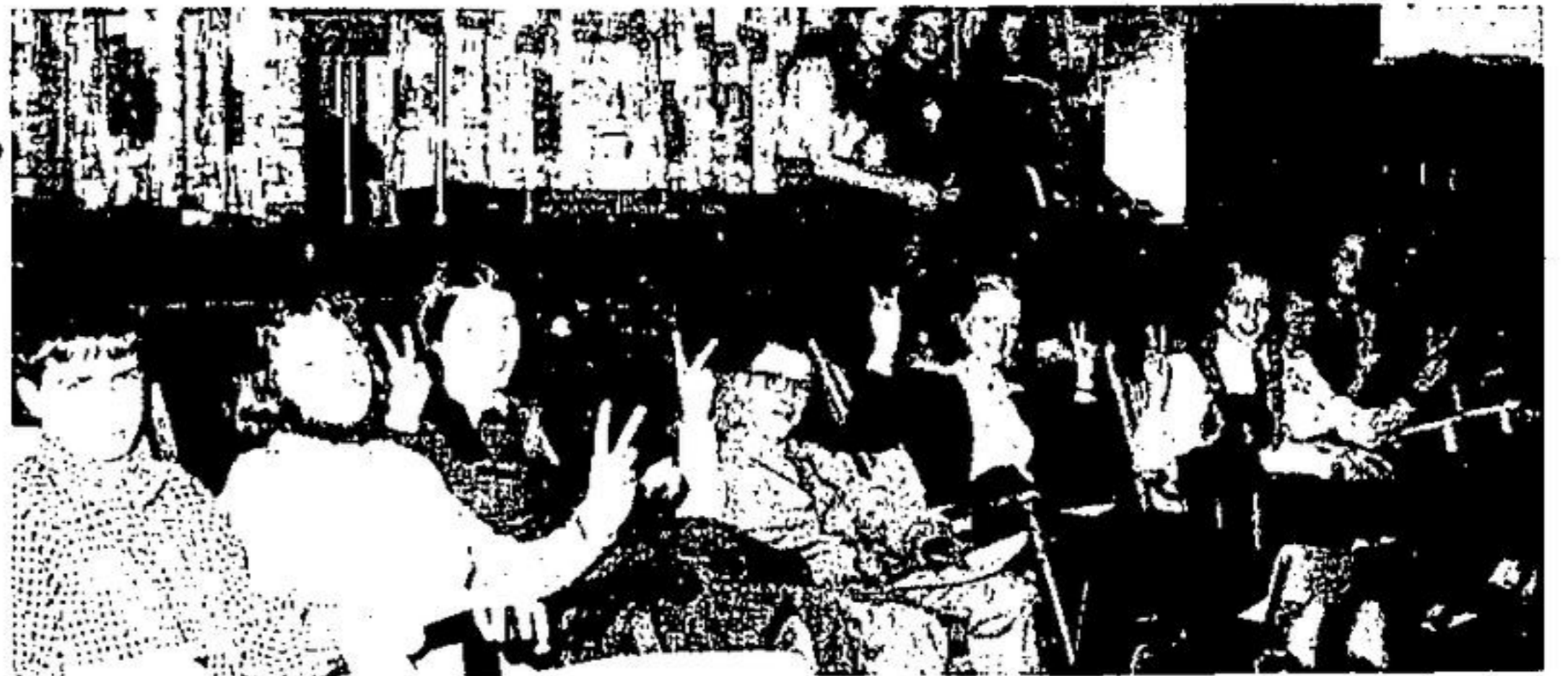
V FOR VICTORY. Confident of lasting those few long minutes remaining to mark 40 hours of non-stop rocking, participants in the Rockathon, held last weekend by the Knox Presbyterian Young People's organization, hold