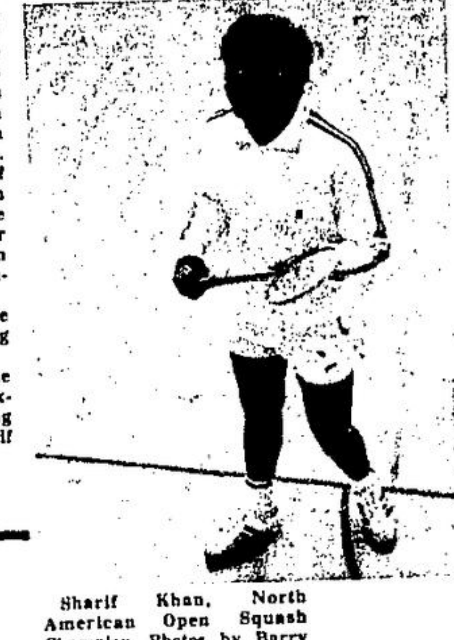
Sharif Khan, North American Open Squash Champion.