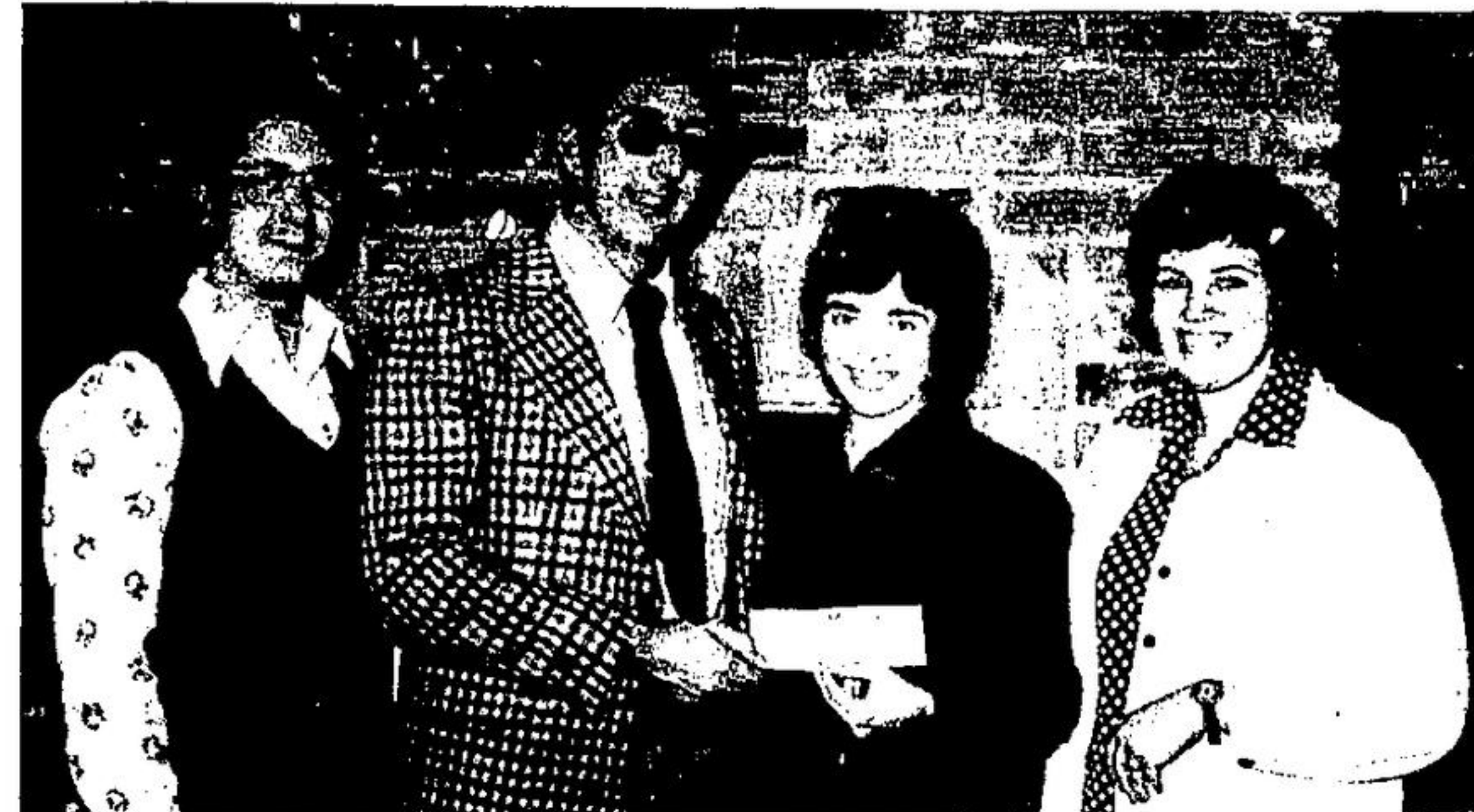
JAYCETTE'S DONATION. The Georgetown Jaycettes last Saturday, at the new home for the mentally retarded in Hornby, donated $500 to the North Halton Association for the Mentally Retarded. The Jaycettes raised the money through their Graffiti Dance held