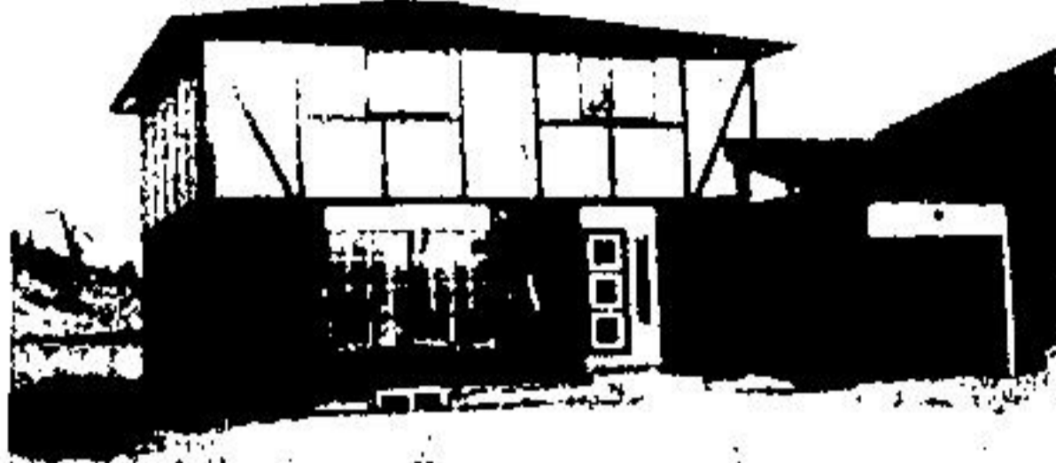
ON KINGHAM ROAD, ACTON $53,900.00 Full Price Our fully detached homes feature the following:

That the first mortgages have the low interest rate of only 8 3/4 percent and that our second mortgages are at only 12 percent and for a 5 year term. Can you really afford not to have a home of your own???. Call us for more details.