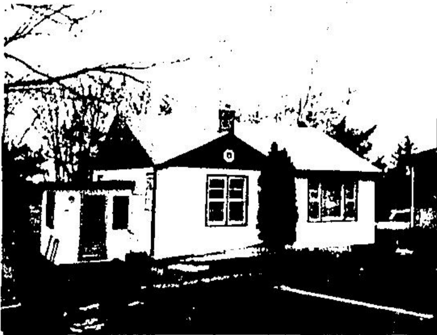
Aluminum siding, 2 bedrooms with a third downstairs, living room and eat in kitchen, recreation room is panelled. Broadloom throughout. Lovely large lot with mature trees. $39,900.00 includes extras. Telephone Kathleen Maxwell 853-0508 or 821-3230.