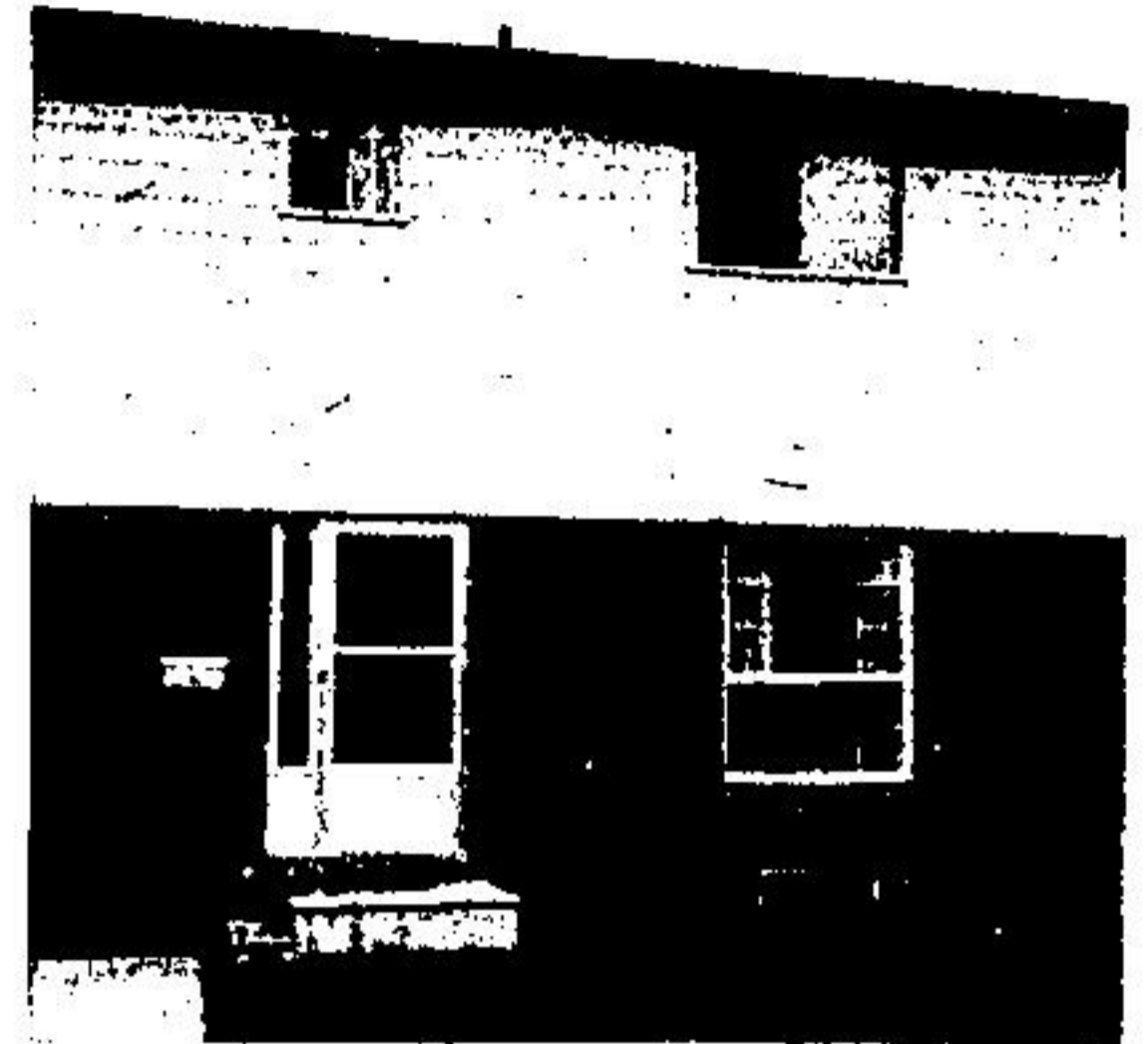
NEARLY NEW TOWNHOUSE $500.00 DOWN PAYMENT

"Model home open for viewing Saturday and Sunday 1 - 5 P.M., otherwise by appointment."