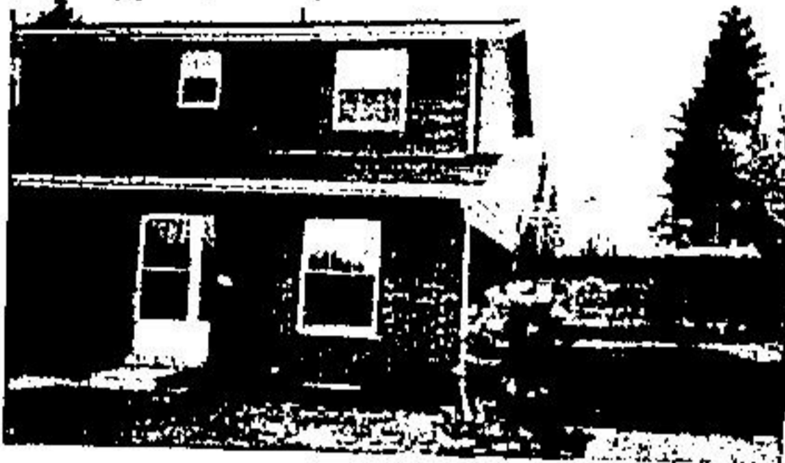
ON KINGHAM ROAD, ACTON $38,900. Full Price