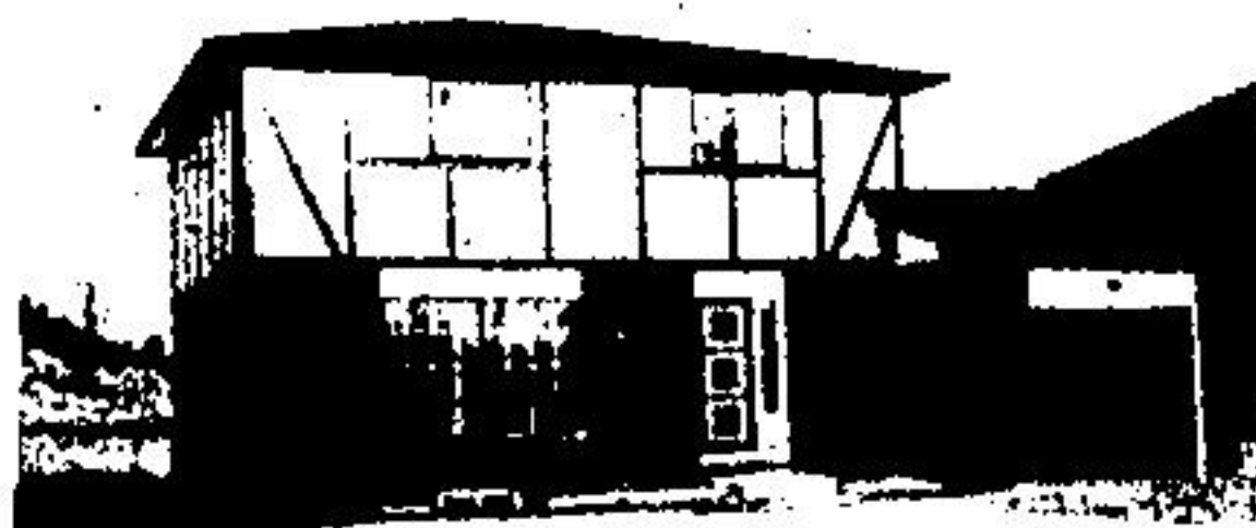
ON KINGHAM ROAD, ACTON $53,900.00 Full Price Our fully detached homes feature the following:

A Townhouse in the country, With a well treed point of view, Where from your bedroom windows, You can see a horse or two, There is a Second Bathroom, And a rec room good as new, With a very low down payment, This home belongs to you.