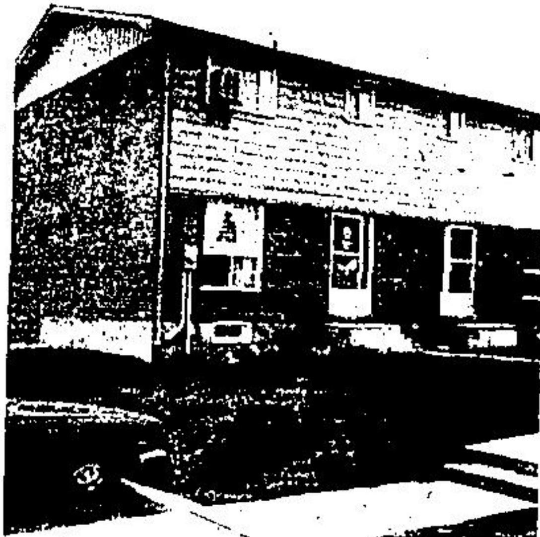
ON KINGHAM ROAD, ACTON Basement walkout $39,900.00

A Townhouse in the country, With a well treed point of view, Where from your bedroom windows, You can see a horse or two, There is a Second Bathroom, And a rec room good as new, With a very low down payment, This home belongs to you.