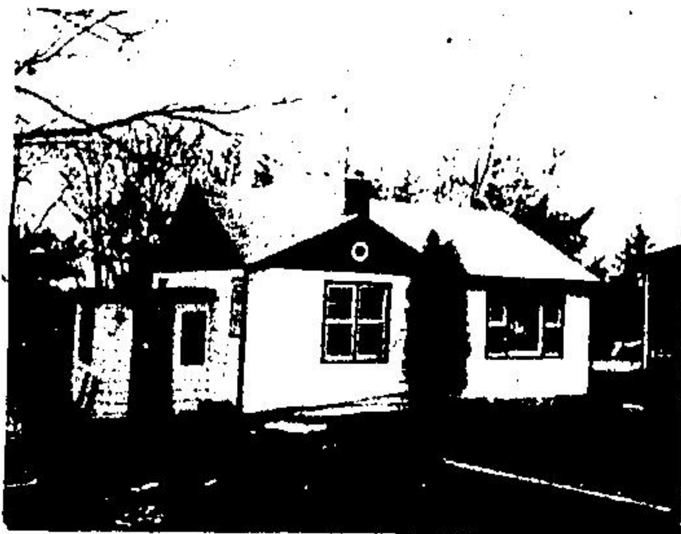
Aluminum siding, 2 bedrooms with a third downstairs, living room and eat in kitchen, recreation room is panelled. Broadloom throughout. Lovely large lot with mature trees. $39,900.00 Includes extras. Telephone Kathleen Maxwell 853-0508 or 821-3230.