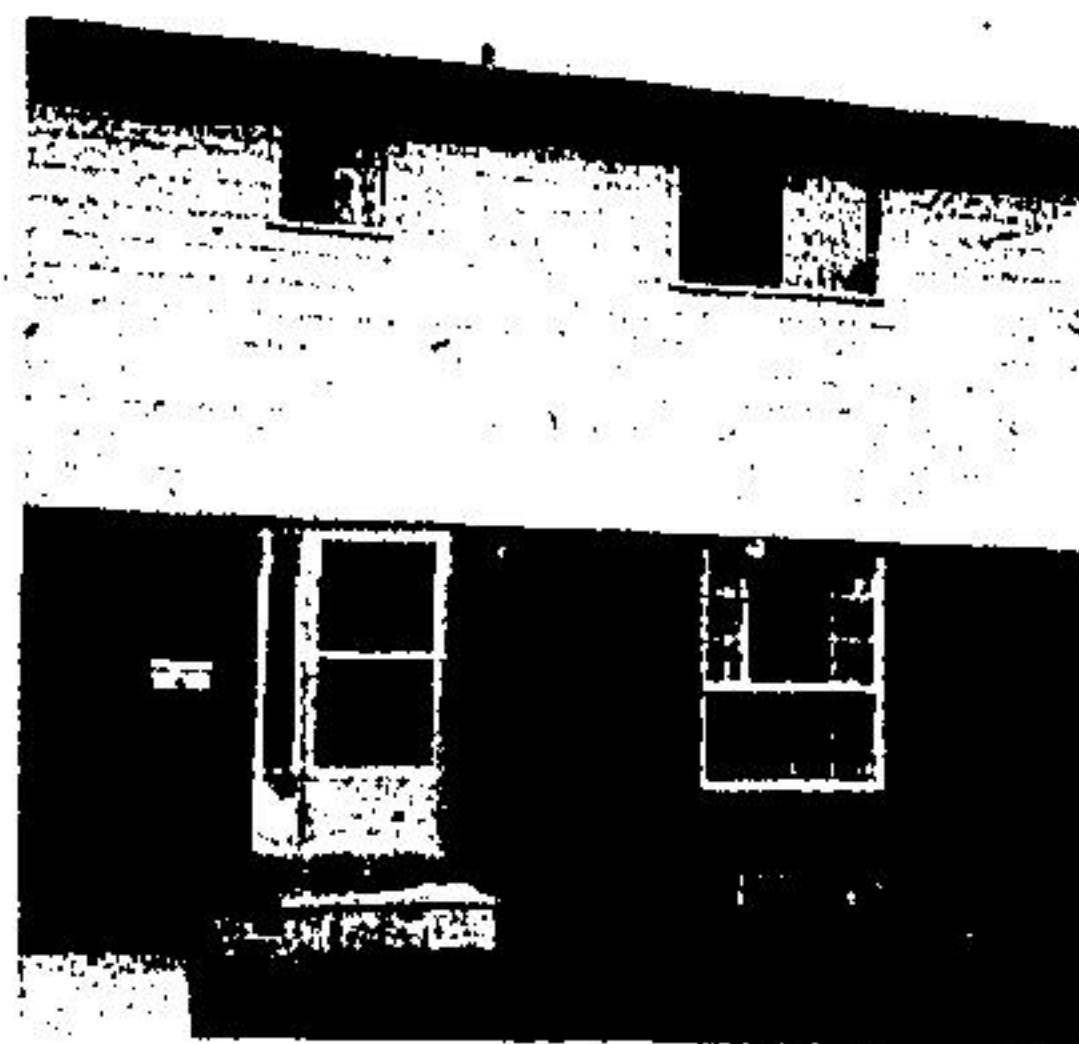
NEARLY NEW TOWNHOUSE $500.00 DOWN PAYMENT well located near centre of Acton - 8¾ percent N.H.A. Mortgage - Immediate possession. Electric Heat, Finished Rec. Room, Im- maculate Hardwood floors throughout. Only one month left for the Provincial Government Grant of $1,500.00 Call (519) 853-0190 days. Evenings (519) 853-1235 or (416) 877-8167.

"Model home open for viewing Saturday and Sunday 1 - 5 P.M., otherwise by appointment."