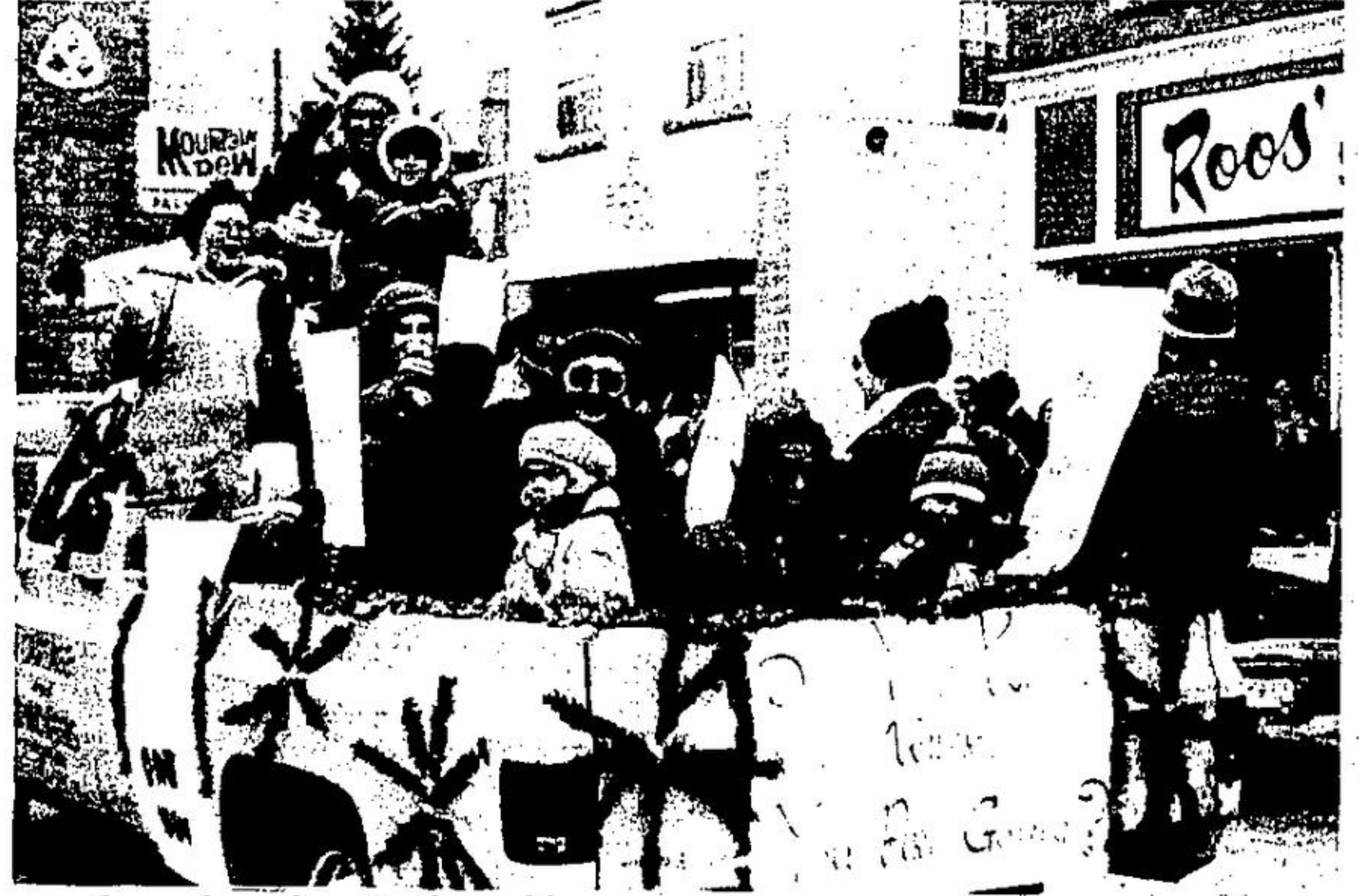
...smiles galore despite the cold