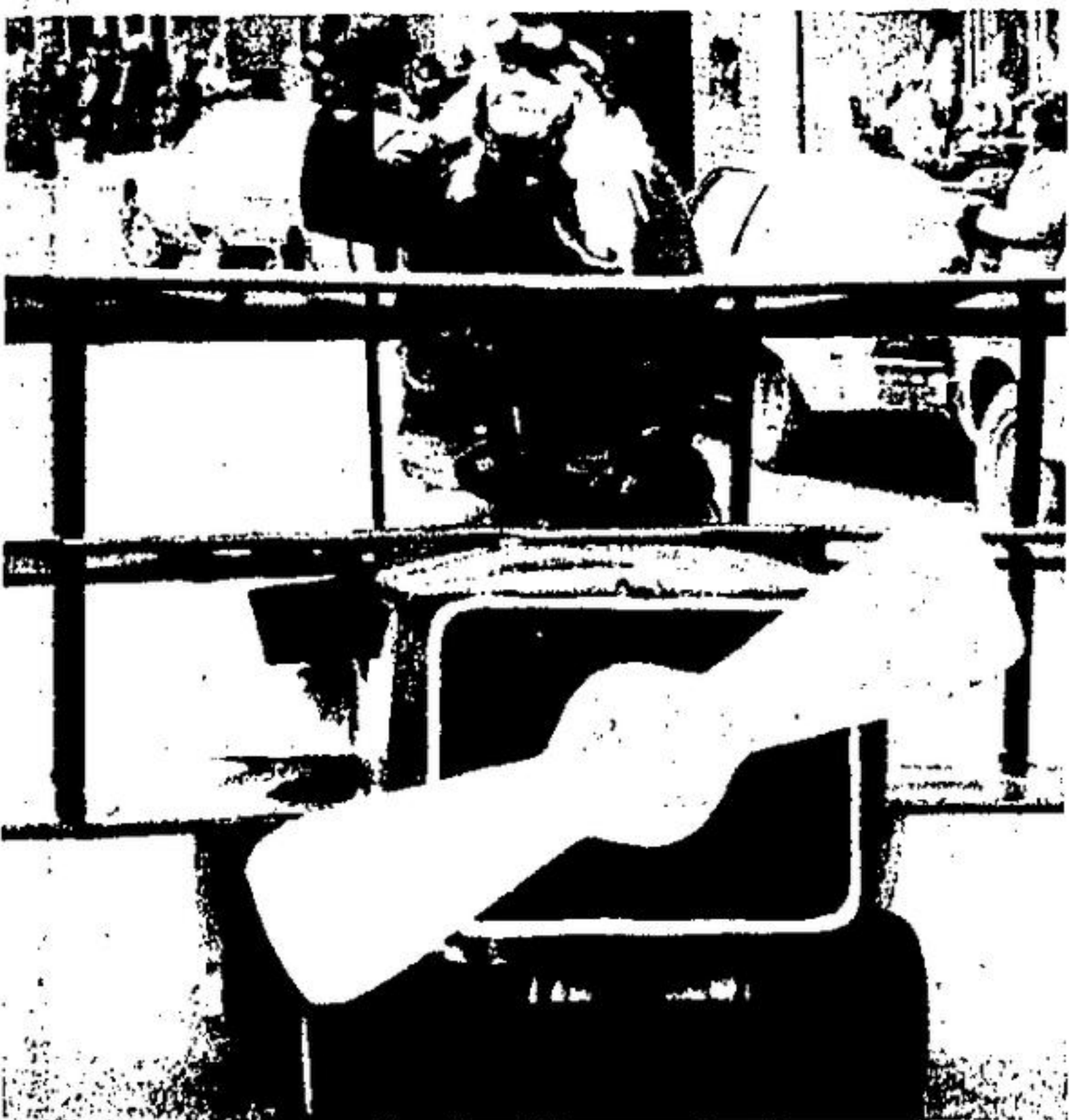
...course you Red Baron