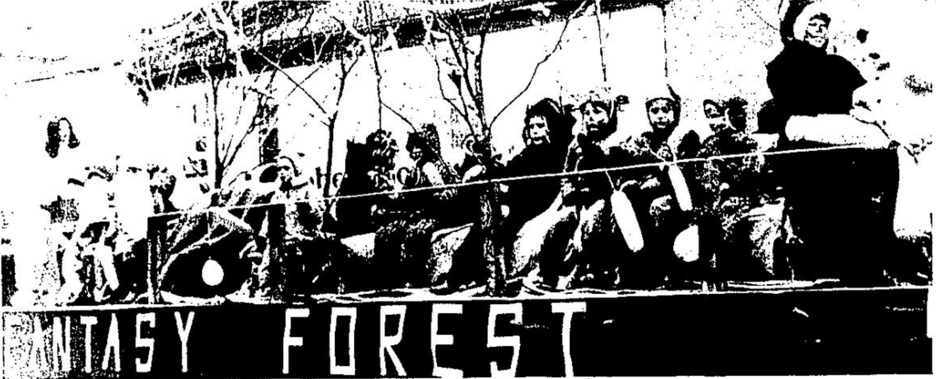
...a fantastic Fantasy Forest