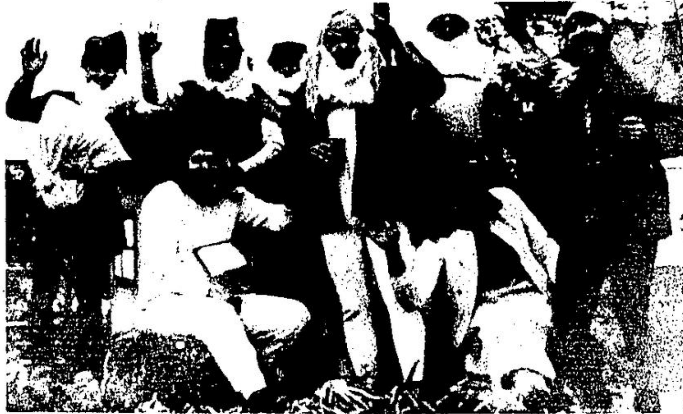
...the Seven Dwarfs had fun