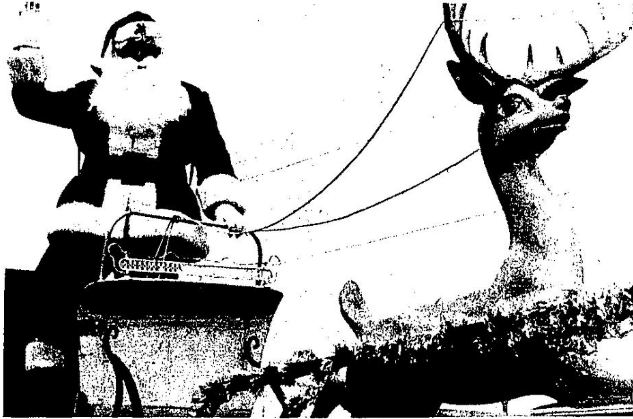
...of course Santa Claus was there

Following the parade the Lions Club held a draw with ten lucky ticket holders each winning a turkey for Christmas. The lucky ticket numbers drawn were: 915, 353, 2115, 1862, 1261, 740, 511, 1058, 1030 and 34. Lions Dick Licata or Sam Callaghan can be contacted if one of those numbers happens to belong to you.