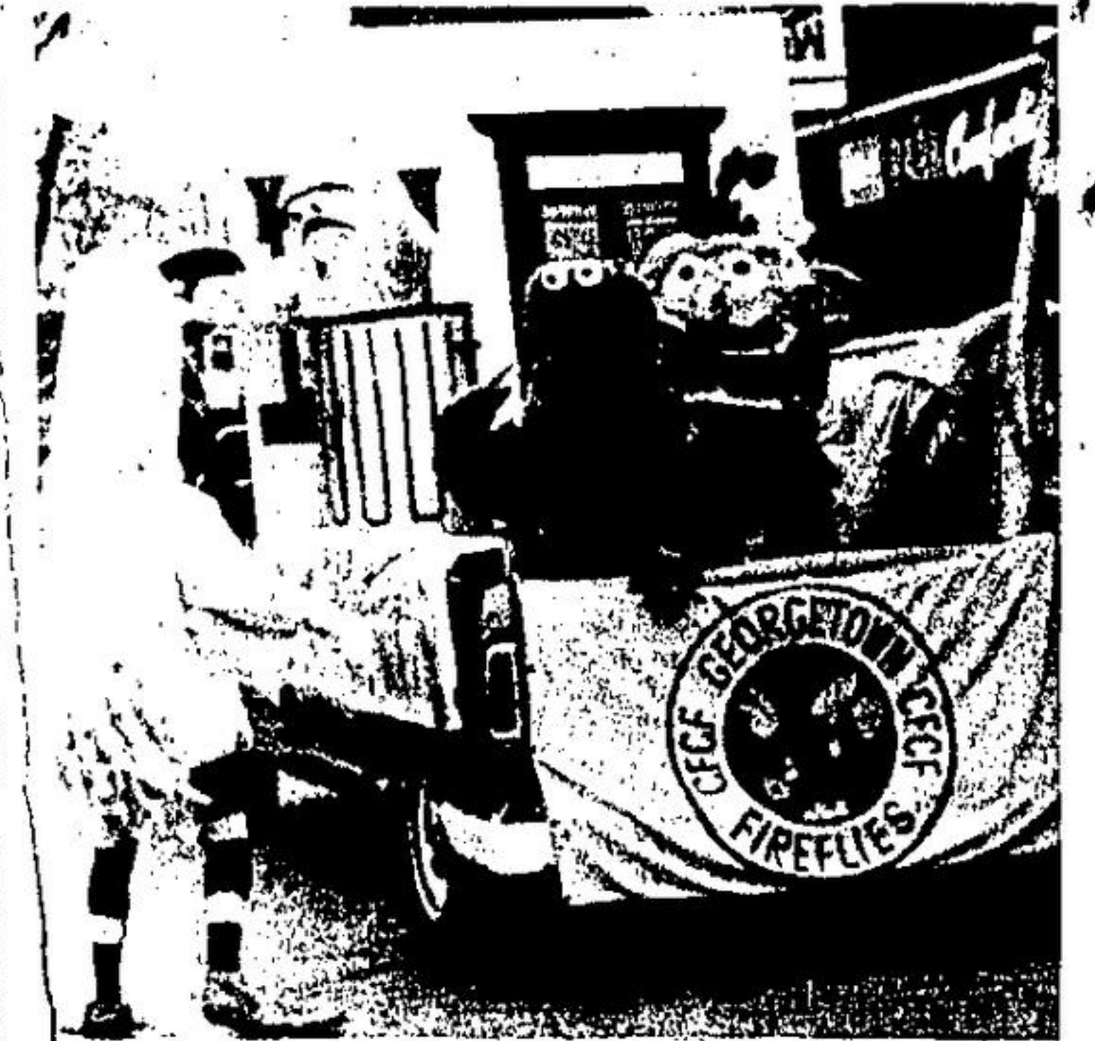
...even Sesame Street paid a visit.