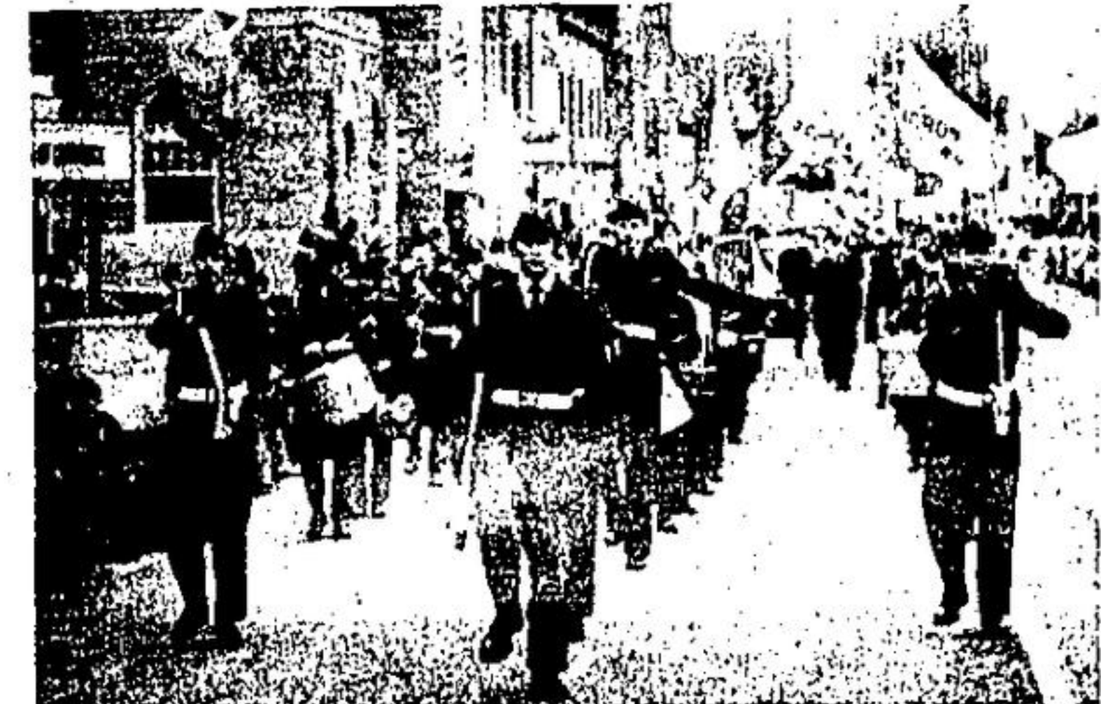
...Air Cadets were in fine form