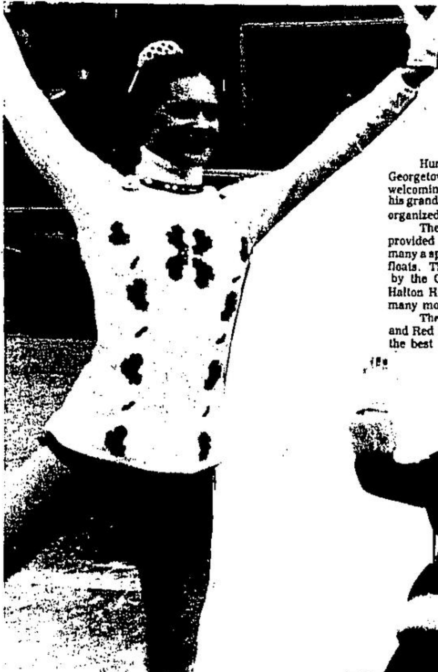
There were cute girls...

Hundreds of young and old alike lined the streets of Georgetown, during Saturday's cold, crisp afternoon, all welcoming that "jolly old man" Santa Claus as he made his grand entrance during the annual Santa Claus parade, organized by the Lions Club of Georgetown.