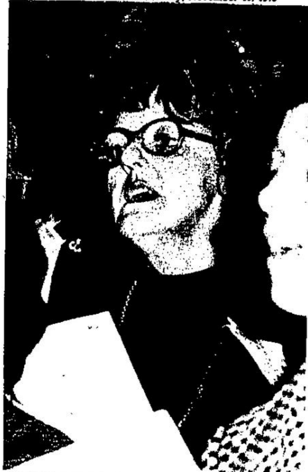
A PRELUDE TO CHRISTMAS is the offering of the Georgetown Choral Society this year and rehearsals are drawing to a close for the November 29 and 30, presentation of familiar Christmas carols. The 68-member choir is almost ready for the special event.