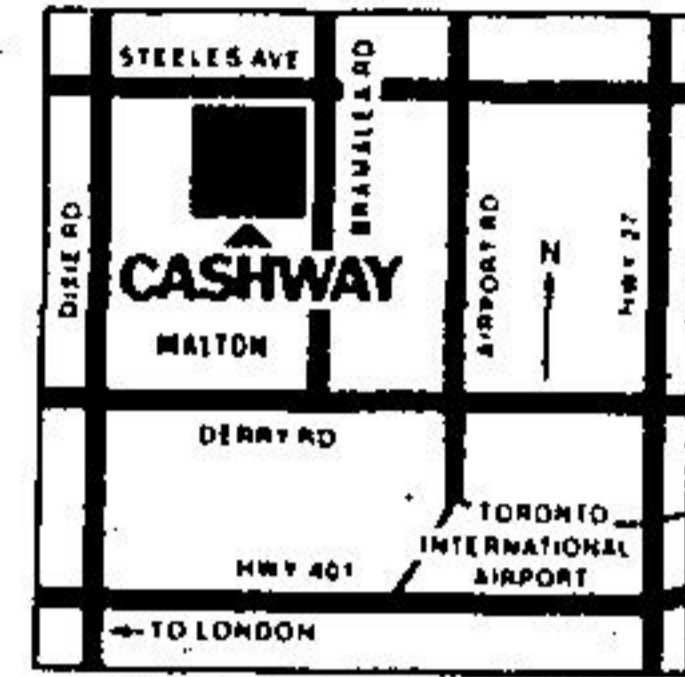
BRAMALEA/MALTON Bramalea Rd. At Steeles, 1 mile north of Airport.

41 CASHWAY CENTRES AT CONVENIENT LOCATIONS TO SERVE YOU WITH FAMOUS LOWER PRICES!