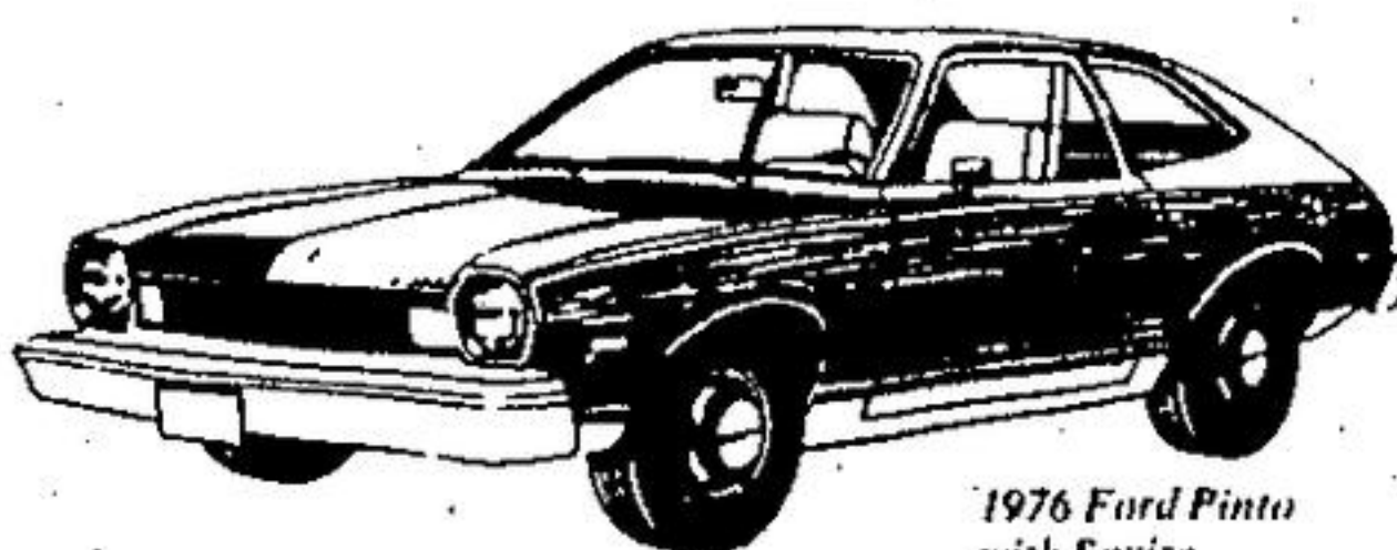
1976 Ford Pinto with Squire Woodgrain Option