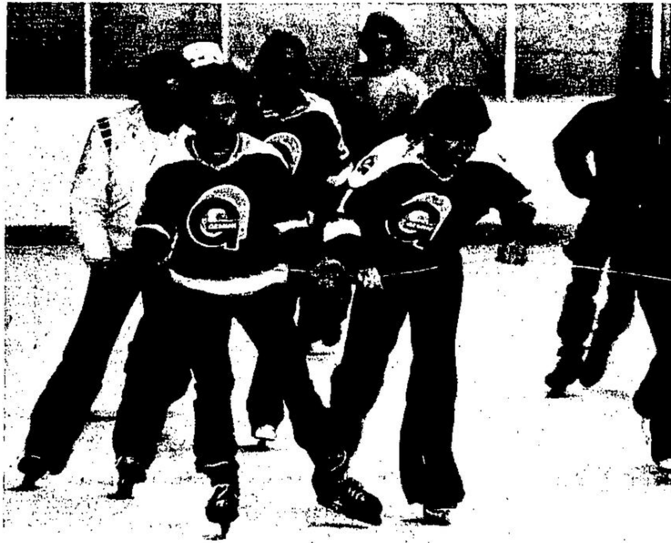
PACING THE GROUP was important to keep track of the laps done by the participants that raised over $10,000 for the Rotary Club's projects.