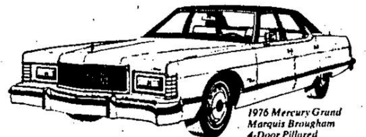
1976 Mercury Grand Marquis Brougham 4-Door Pillared Hardtop

The exciting new 1976 Fords and Mercurys are here! The cars with some very exciting news. First, the '76's are done up in style. Simply beautiful. With glamorous new exterior colours and super-looking new interiors in choices of fabrics and vinyls. And a terrific list of options including zippy tu-tone colour schemes, styled-steel wheels, and a wide range of stylish seating choices like Twin Comfort Lounge Seats, Flight bench seats, and front bucket seats. Be sure to ask about the Pinto 3-Door Runabout with Squire Woodgrain Option, the proven, dependable Comet, or the ride-improved Granada.