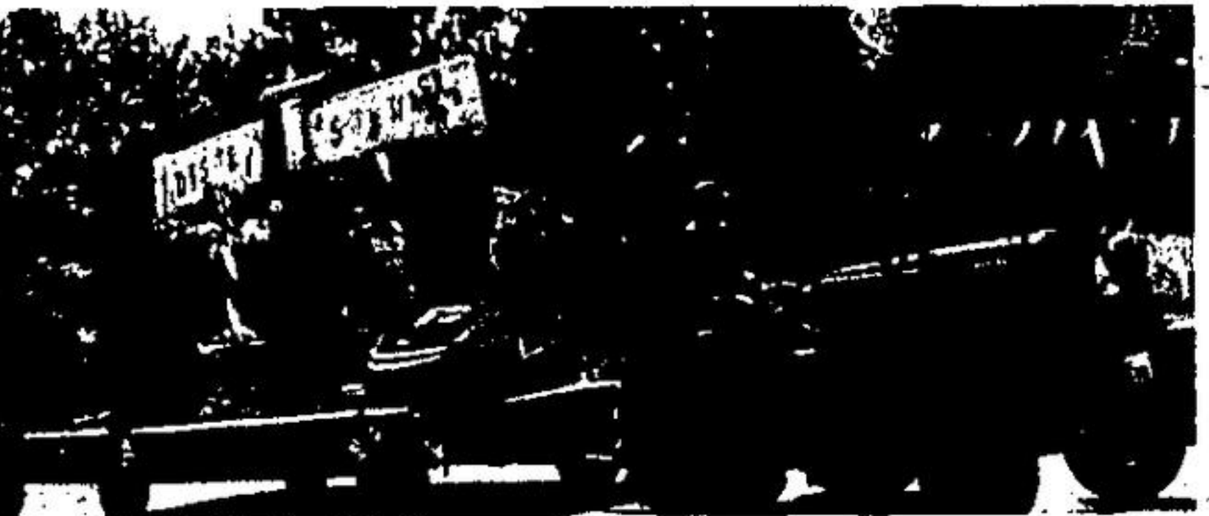
FIRST PRIZE FLOAT. Four members of the local media rated the 'Disney Goes Snow' float entered by the Hillsburgh Snowmobile Club as the best float in the Hillsburgh Potato Fest parade.