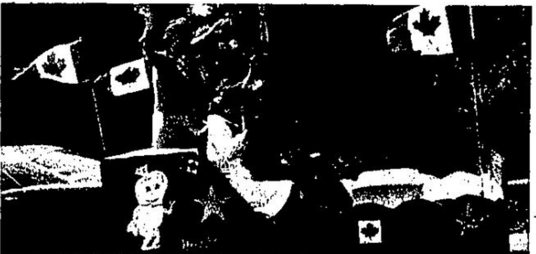
LOCAL BEAUTIES. One of the prettiest highlights of the Grand Parade in the Hillsburgh Potato Fest was the appearance made by a number of the local beauty queens.