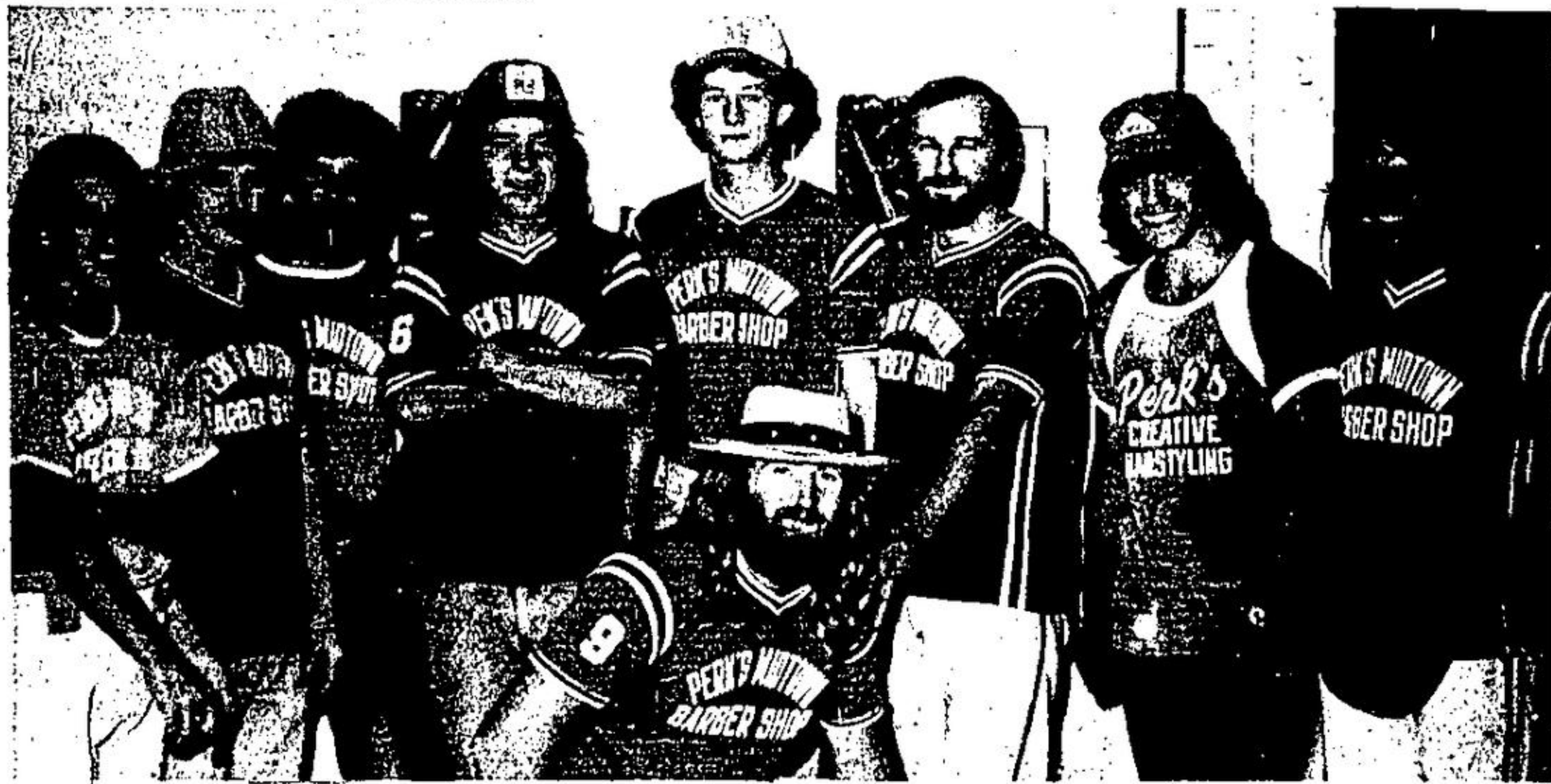
RUNNERS-UP in last weekend's Glen Williams Industrial Fastball Tournament were Perks of the Georgetown Industrial Fastball League. Perks lost out to Erin, 11-4 in the championship final as the burden of three games in one day proved too much for the local crew. From left to right,