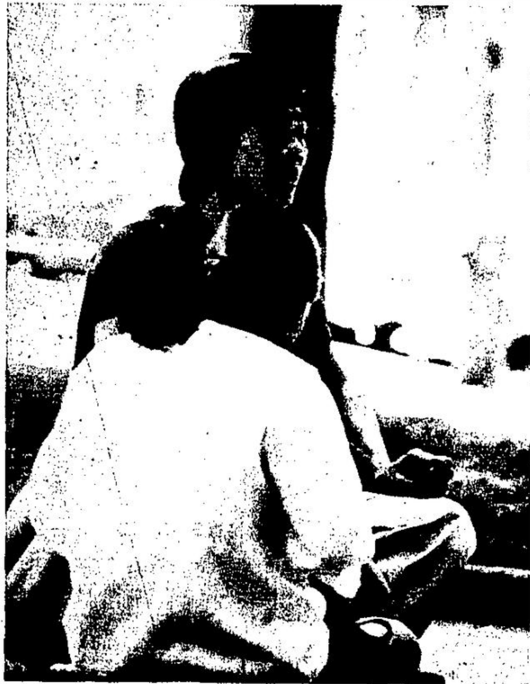
AN UNCERTAIN FUTURE —Faced with an entirely new way of living in the heart of busy Montreal the Vietnamese and Cambodian refugees are undaunted as they begin their lives anew.