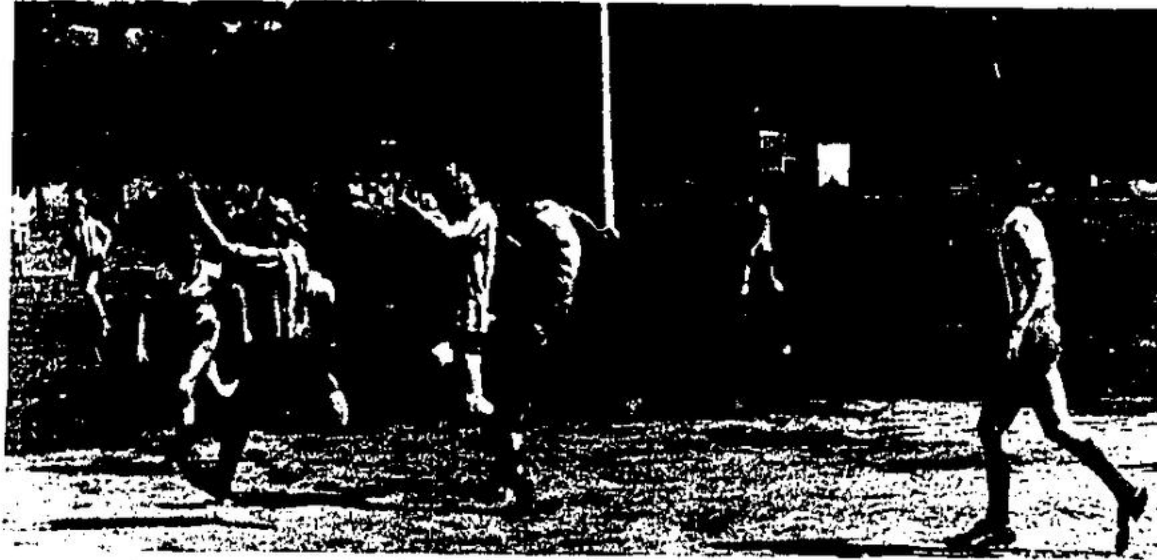
ACTION WAS THE CRITERIA in Sunday's exhibition contest between the Georgetown Bantam Rep Team and Apollo, a Bantam All-Star team from Hamilton. The Georgetown crew walked all over the All-Star team in the