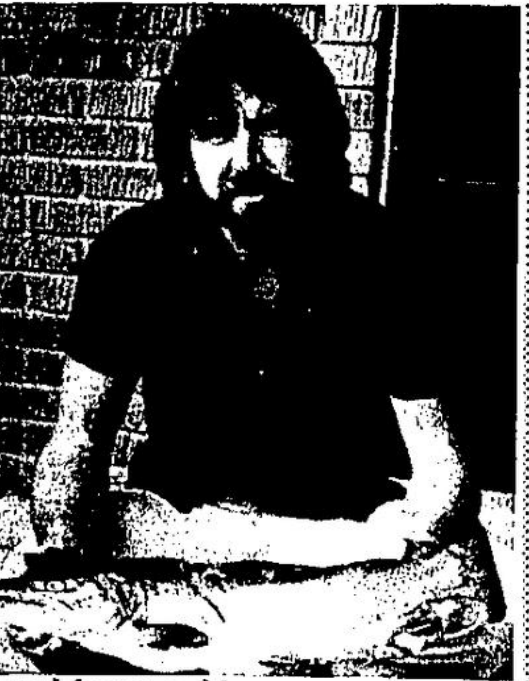
and last week's