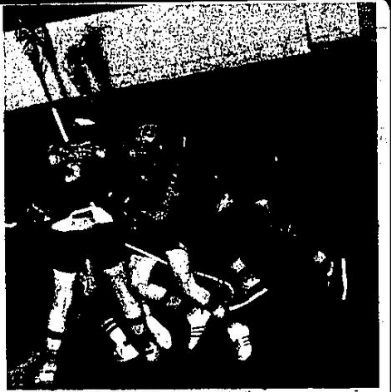
ACTION WAS FAST AND FURIOUS in the encounter between the Halton Hills Rams and the Orangeville Stingers Monday night at the Georgetown arena. The Rams came out on top, however, defeating the Stingers 12-9 for the second consecutive win over the second place club.