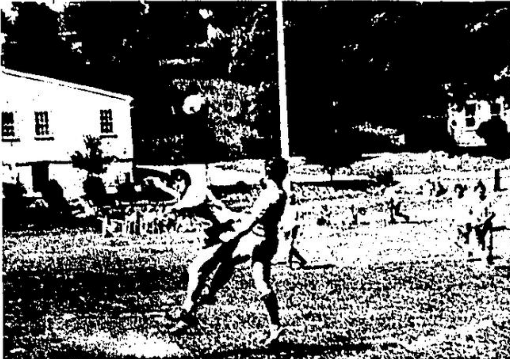
HEADS-UP PLAY is the name of the game in last Sunday's soccer match between the Georgetown Falcons and Hansa International of Brampton. The Falcons won the day and the game 3-1 and are rapidly showing that they are indeed contenders for the league leadership.