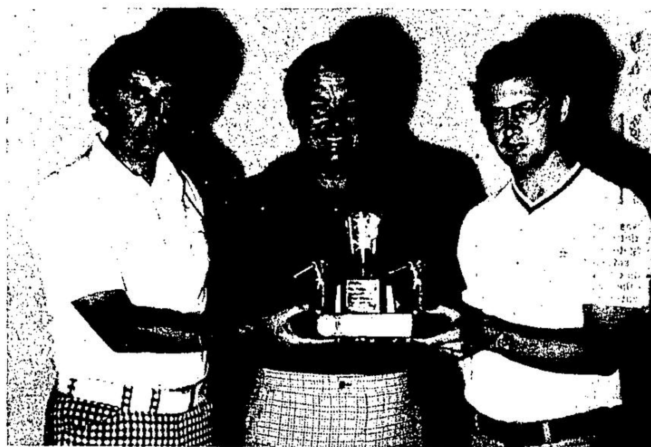
THE WINNING TEAM with the best Low Gross score in the annual Chamber of Commerce Golf Tournament was Georgetown's own Chamber of Commerce. Here team

and five errors. The Gage gang plays in Campbellville Wednesday before travelling to Sarnia on Saturday to compete in the Gold Bat Tournament.